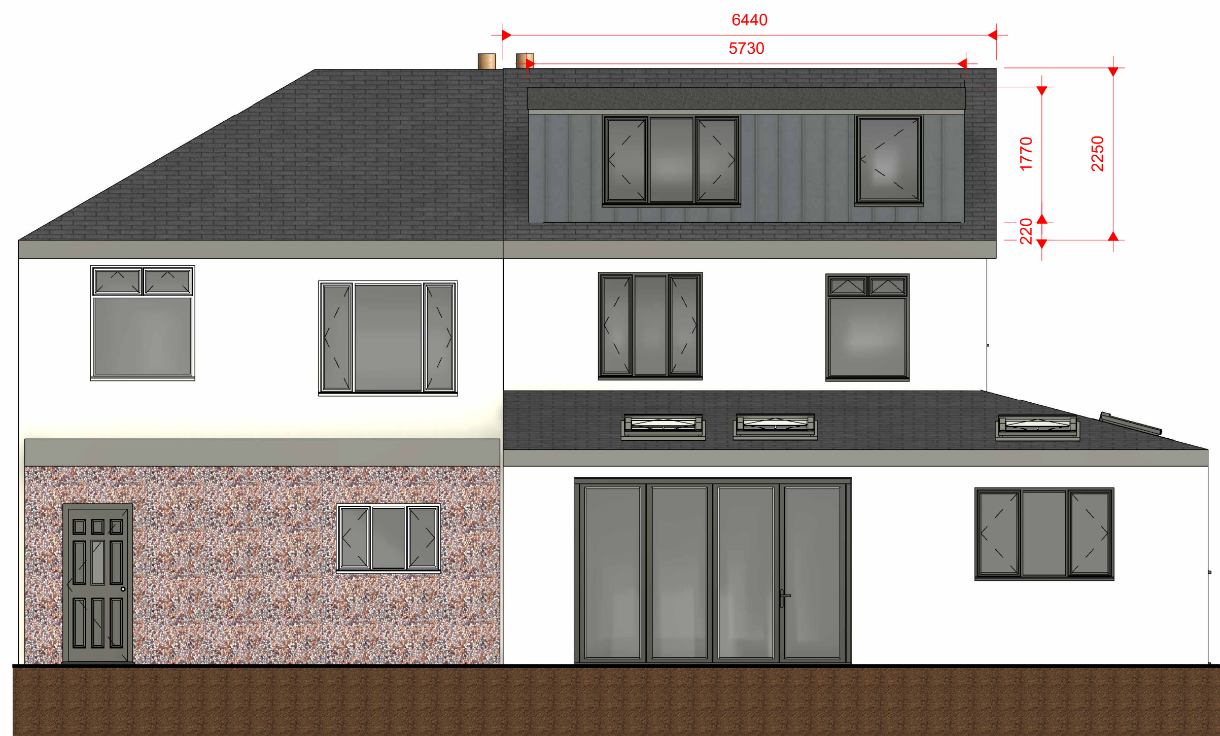
3 PROPOSED REAR ELEVATION