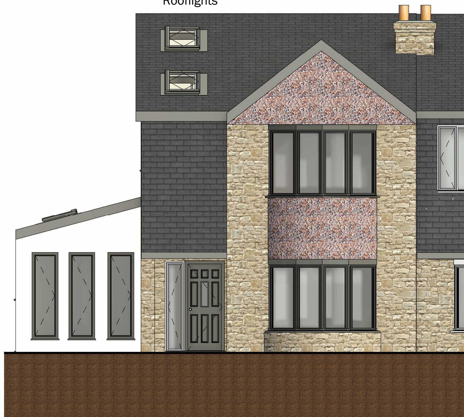
1 PROPOSED FRONT ELEVATION