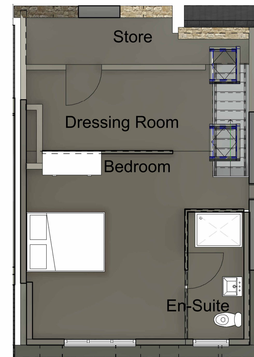
3 2 PROPOSED SECOND FLOOR 1 : 50