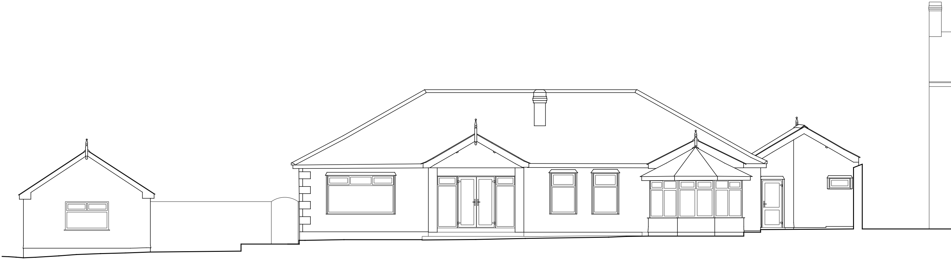
REAR (SOUTH) ELEVATION