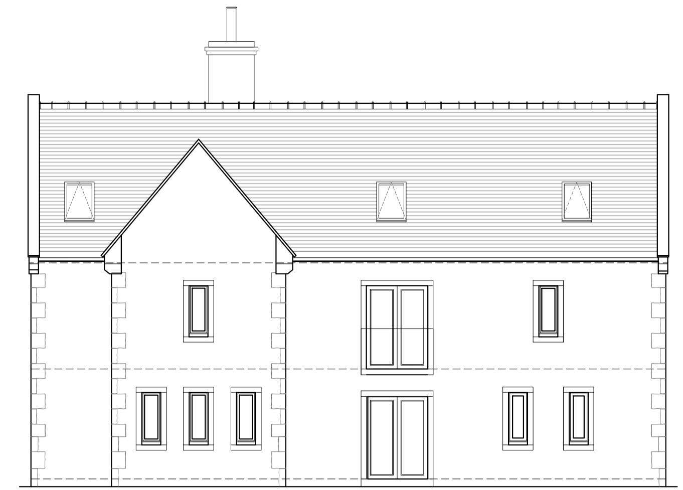
EXISTING WEST ELEVATION Scale 1:100