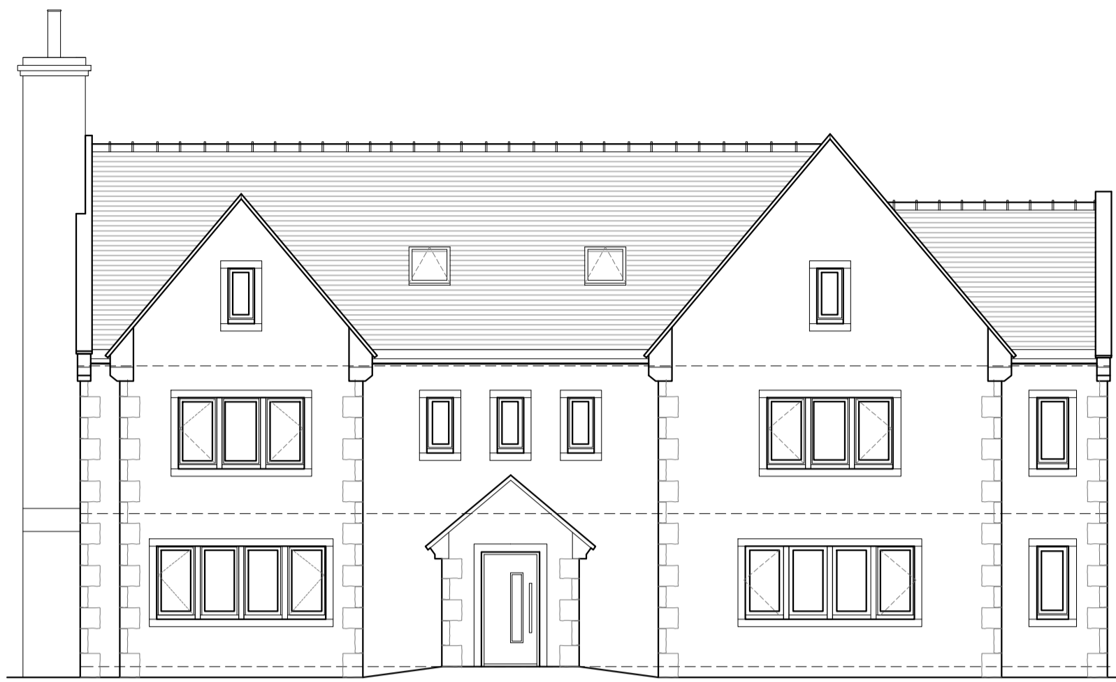
EXISTING SOUTH ELEVATION Scale 1:100