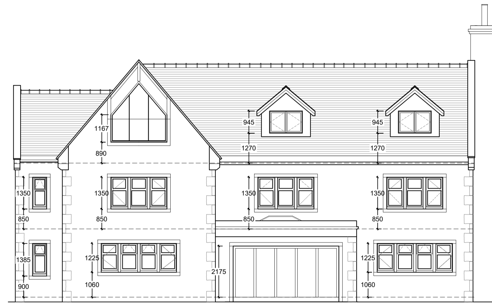
EXISTING NORTH ELEVATION Scale 1:100