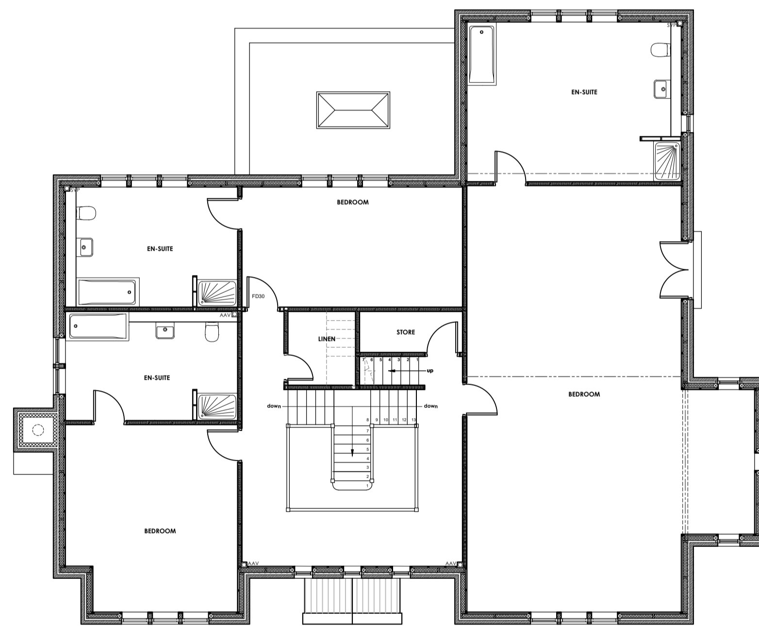
EXISTING FIRST FLOOR PLAN Scale 1:100