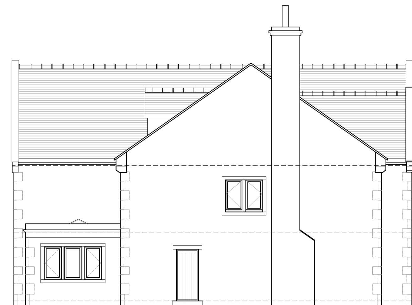
EXISTING WEST ELEVATION Scale 1:100