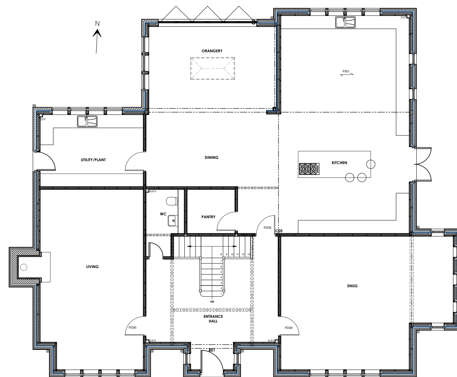
EXISTING GROUND FLOOR PLAN Scale 1:100