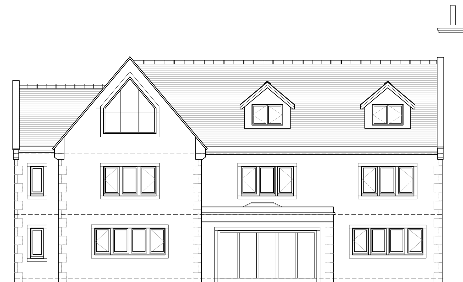
EXISTING NORTH ELEVATION Scale 1:100