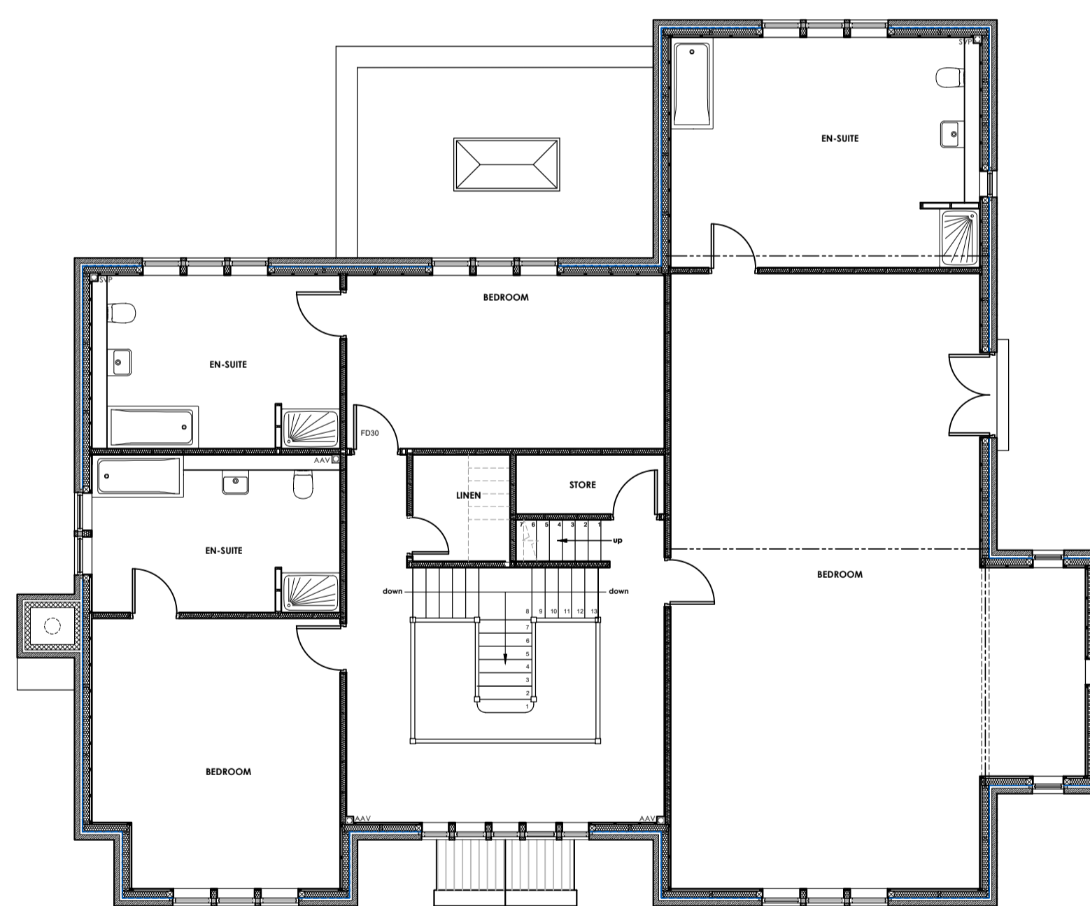
EXISTING FIRST FLOOR PLAN Scale 1:100