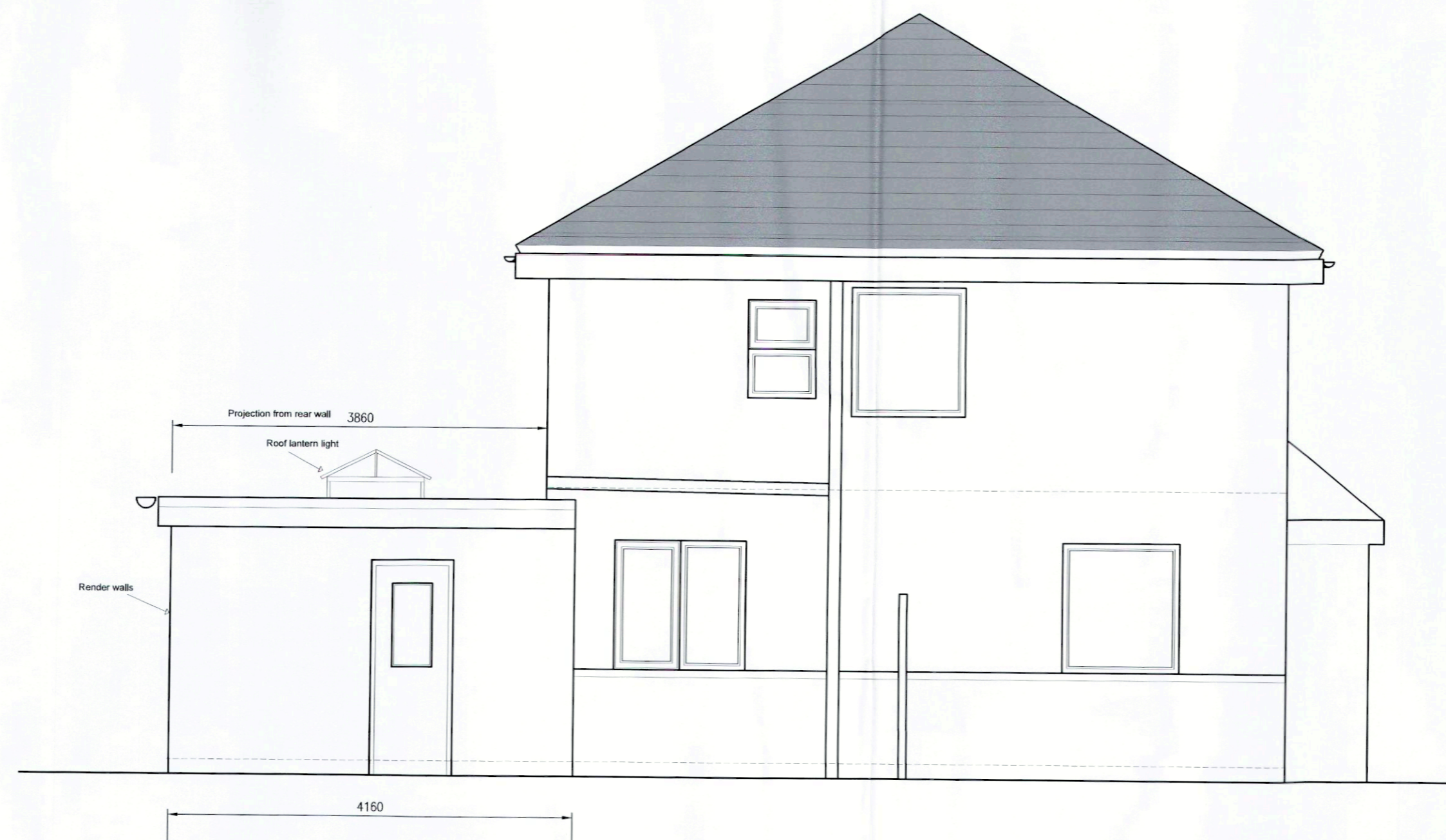
SCALE 1:50 0 1 2 3

Architectural floor plan of the first floor. The plan includes the following rooms and features: LOUNGE : 4369 DINING : 3501 KITCHEN : 720 GARDEN ROOM : 1531 UTILITY : 1531 WC : 1501 Bathroom : 590 Staircase : UP Front Porch : 883 Rear Garden : 3501 Dimensions : 3860, 3000, 250, 883, 3501, 5947, 720, 1501, 590, 1531, 800, 4100 Labels : American fridge, WASHING MACHINE, Dryer unit