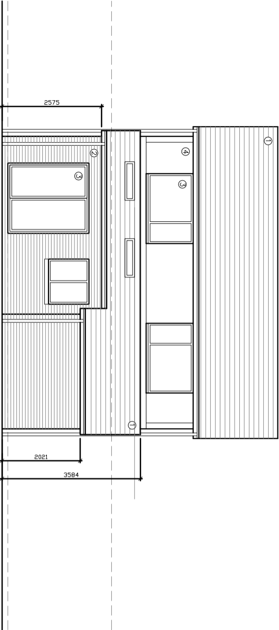
PROPOSED ELEVATION 3