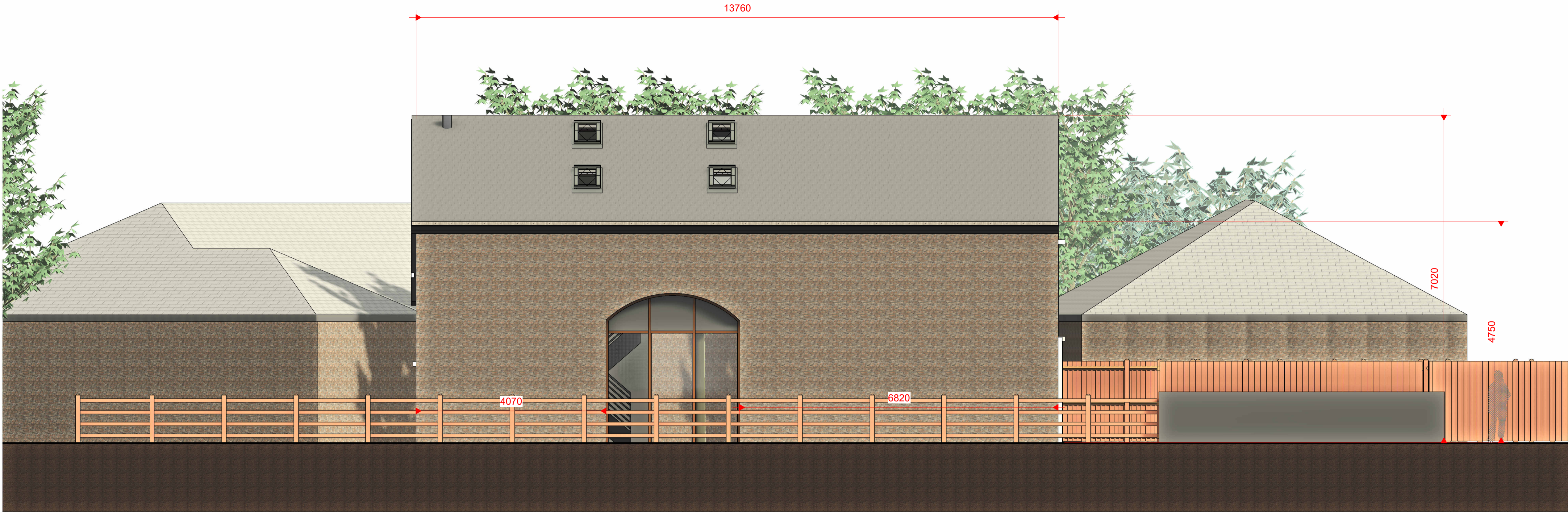
1 PROPOSED NORTH EAST 1 : 50