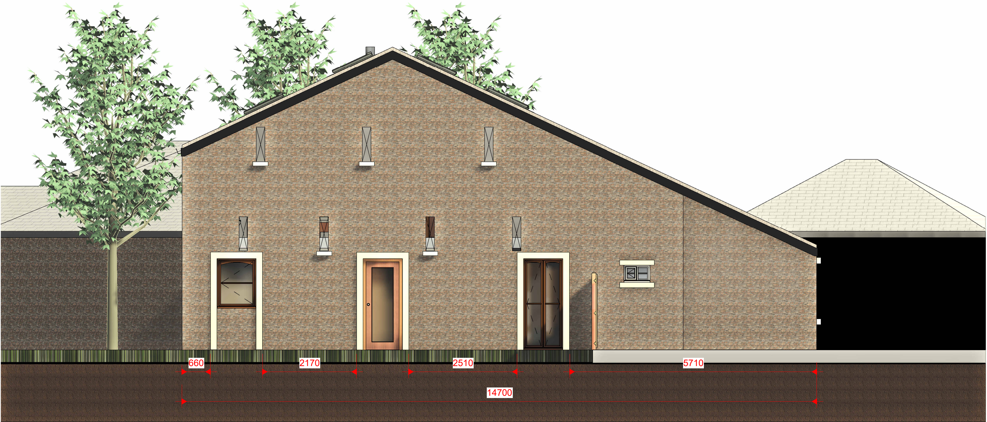
2 PROPOSED NORTH WEST 1 : 50