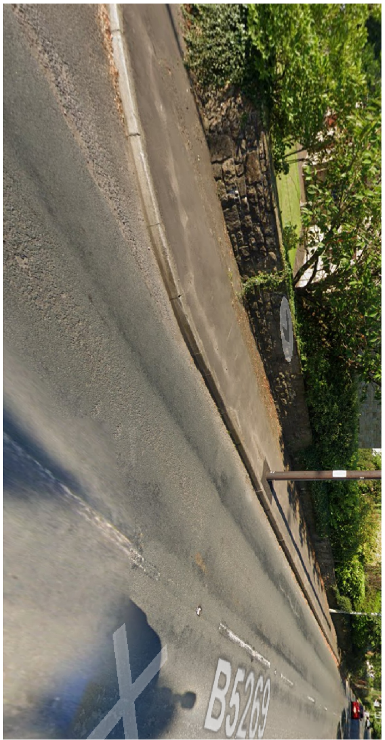
View looking back at Visibility to East - over pavement