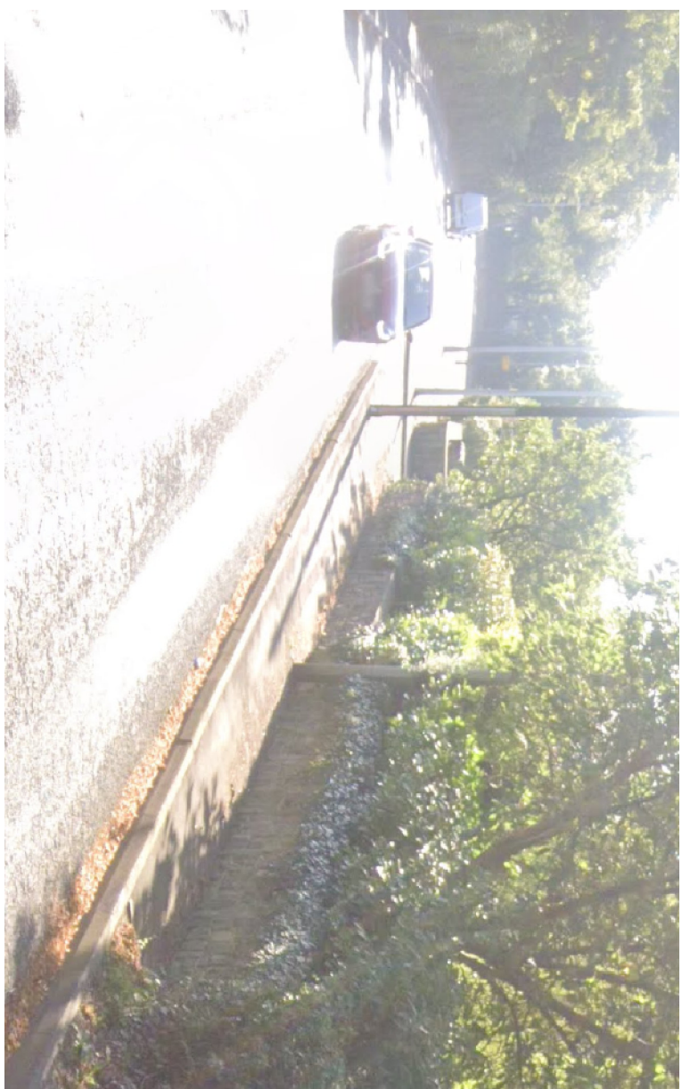
Visibility to East