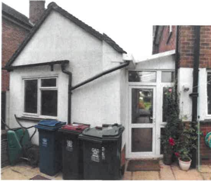
Rear elevation of the garage and lean to link.