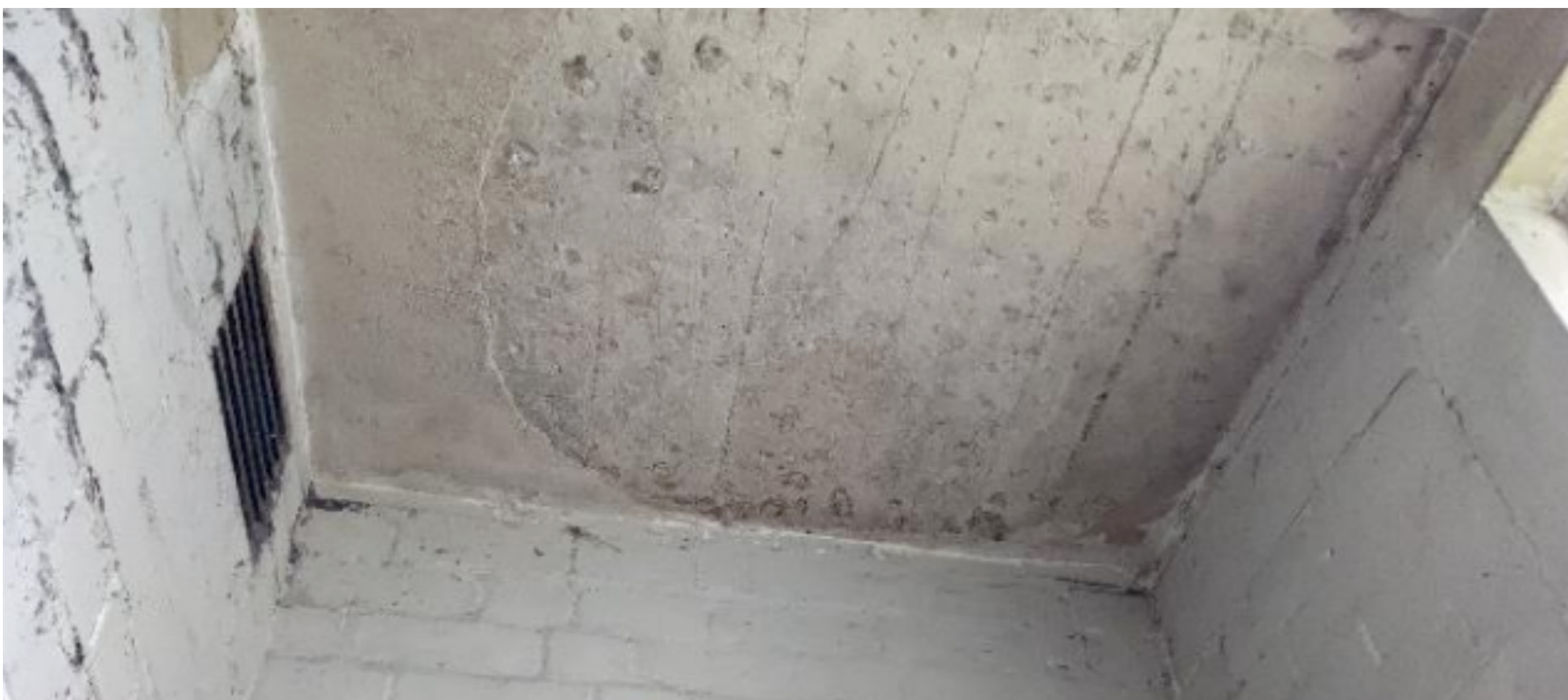
Internal image of the concrete roof and cinder block walls.

This indicates the building is of a more recent construction, of the mid 20 th century and therefore does not have any particular historical significance.