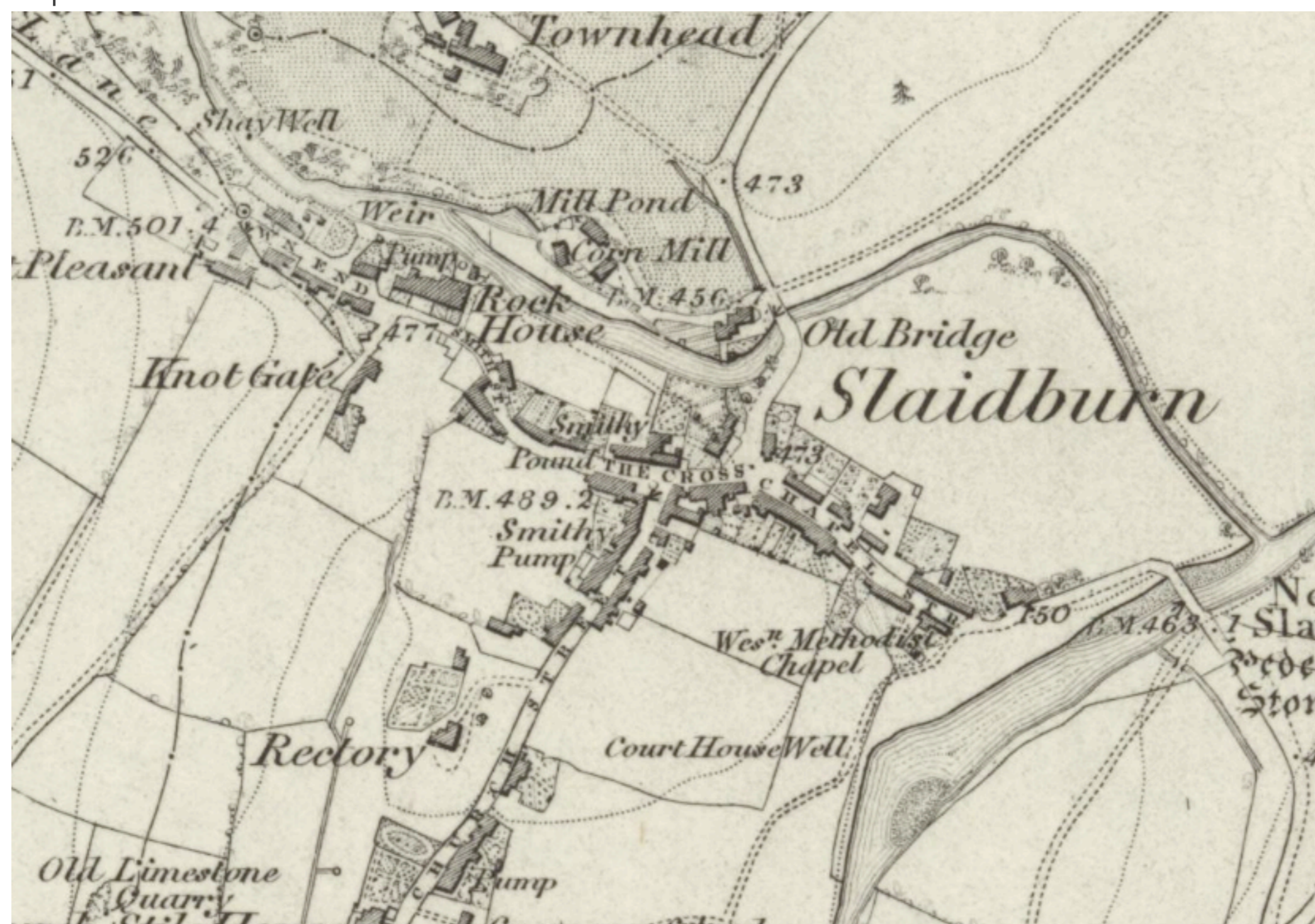
1847 OS map

Number 15 appears on all of the Ordnance Survey maps that are publicly available back to the 1845 map, with the building demarked into three individual dwellings in the later 1894 map. The former police cell is not shown within any of these maps, though in the more recent maps a building separate from the terraces is present.