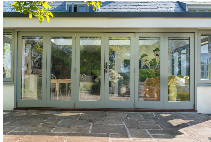
Proposed Painted Timber Bi-folding Doors