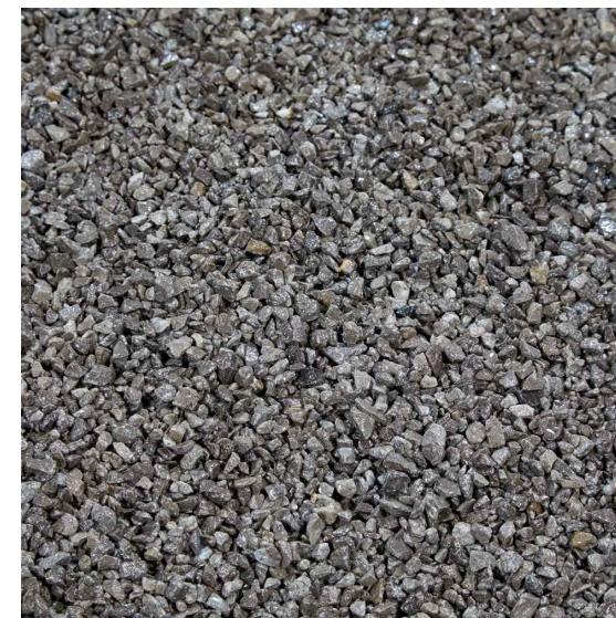
Proposed Gravel Driveway