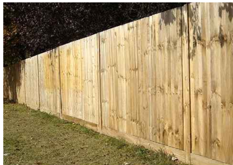
Proposed Closed Boarded Timber Fence