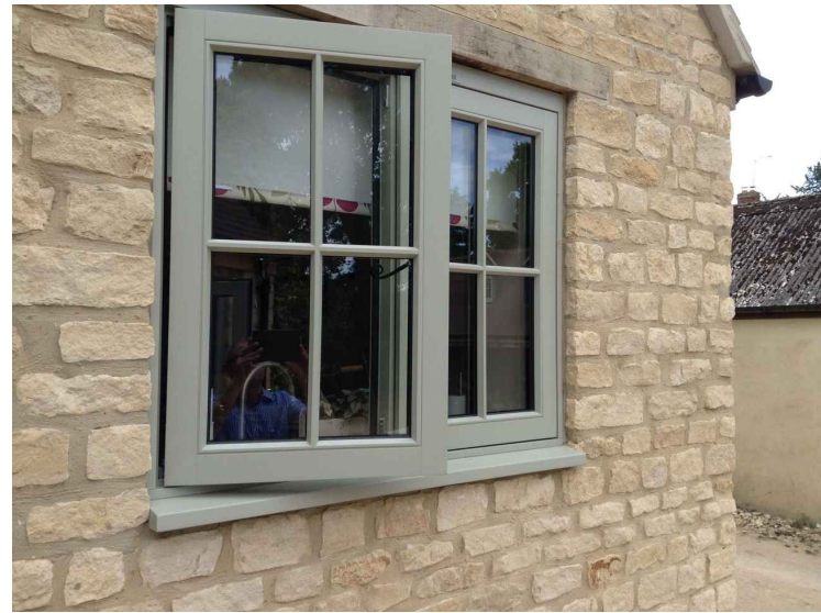
Proposed Painted Timber Windows