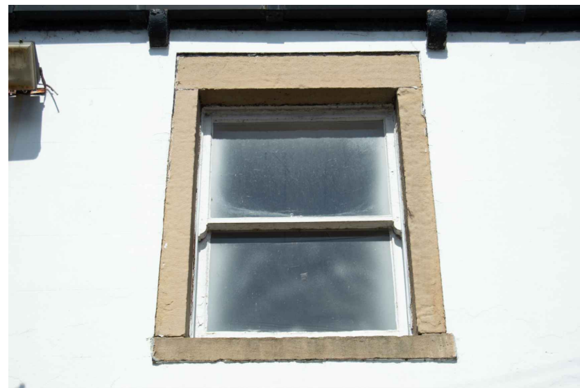
Proposed Stone Window / Door Surrounds to Match Existing