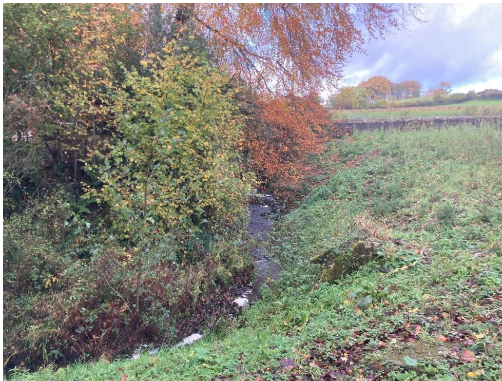
Photograph 8- Ash tree at Target Note 8