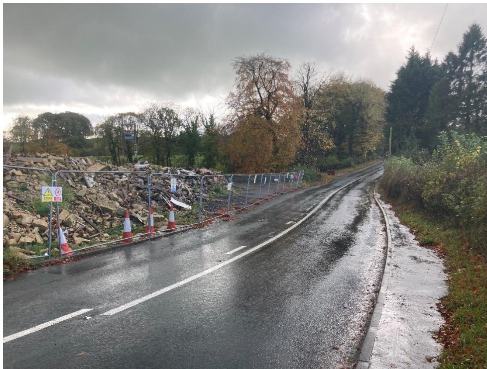
Photograph 2 - Ruderal herb and spoil heaps at northwest corner of site