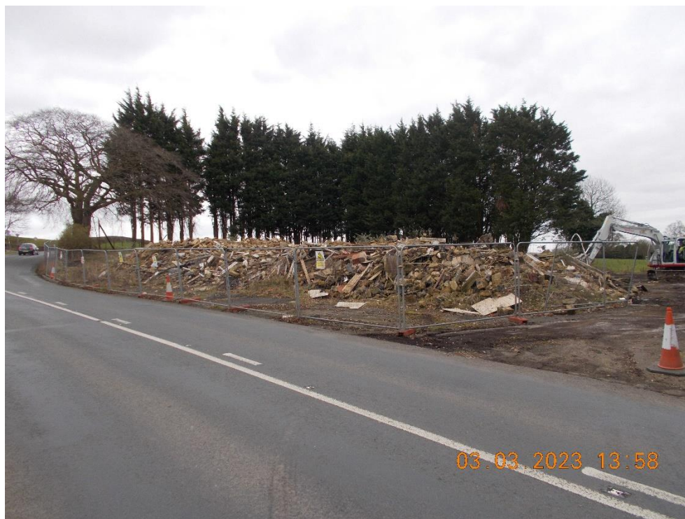
Photograph 10 - Line of conifer trees at Target Note 7