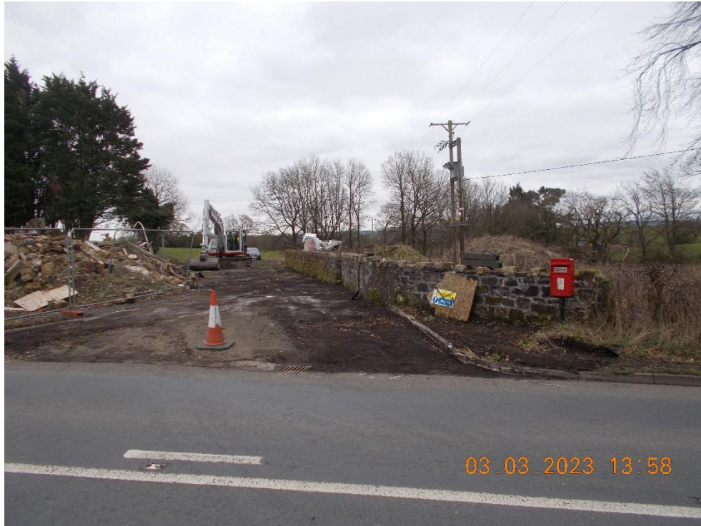
Photograph 12 - Spoil hap to rear of conifers at Target Note 7