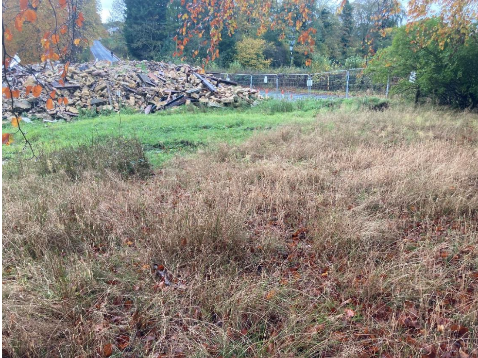
Photograph 6- Short perennial habitats at Target Note 1 (southwest corner of site)