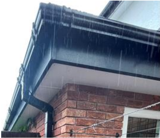
Side lean to soffit