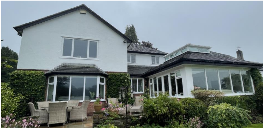
Rear elevation (West)