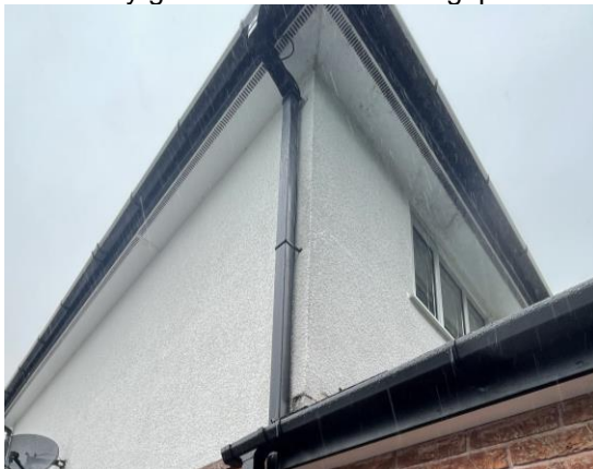
Main roof soffit

The tiles are in good condition with no gaps or lifted slates. There is some moss coverage present. The soffits and fascia's are in excellent condition, very tight fitting with no gaps. The lead flashings are in very good condition with no gaps.