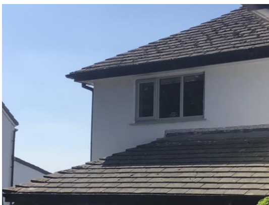
Lean to and main roofs