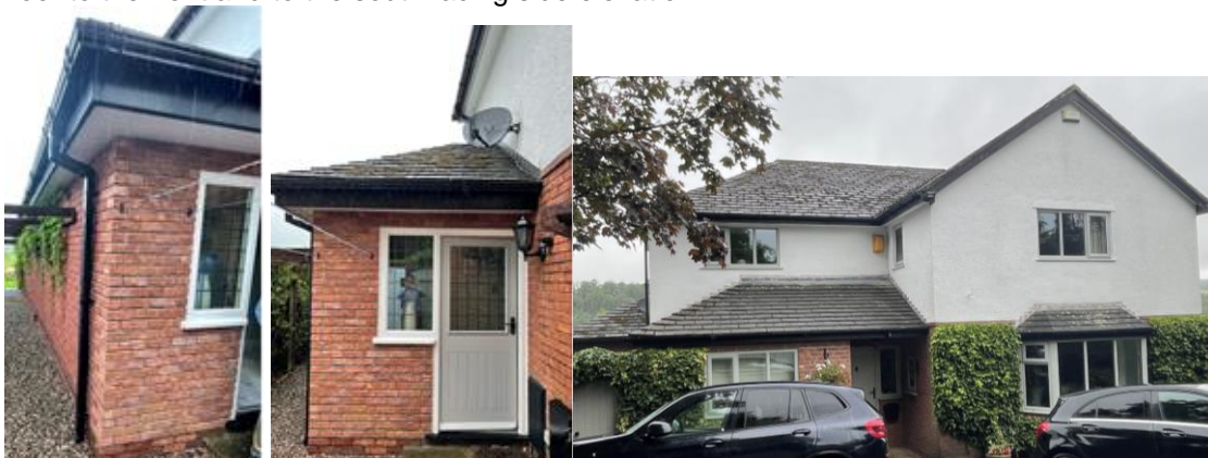
Side outrigger and Front elevation ( East)

The property is a detached house probably dating from 1950's which has been extended at ground floor to the front and to the south facing side elevation.