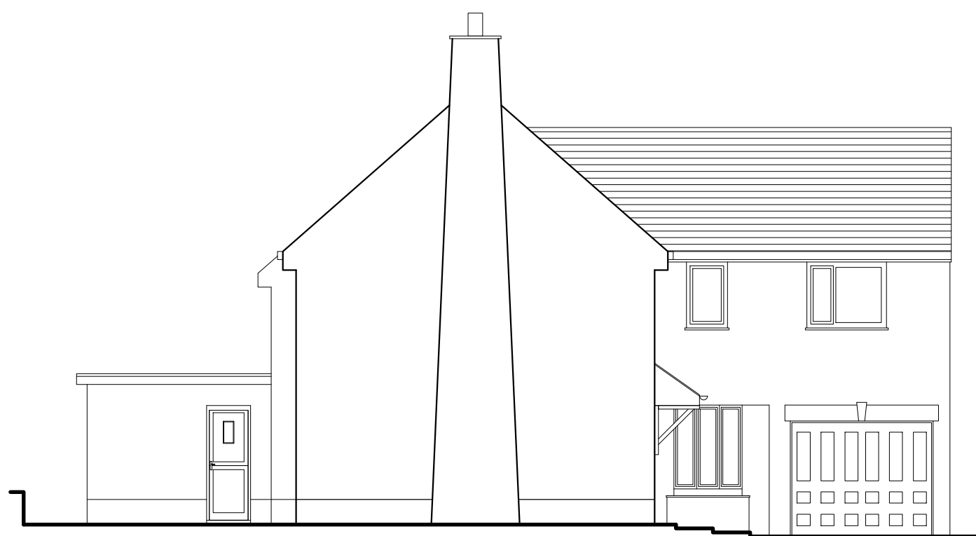
EXISTING SIDE (NORTH) ELEVATION Scale 1:100