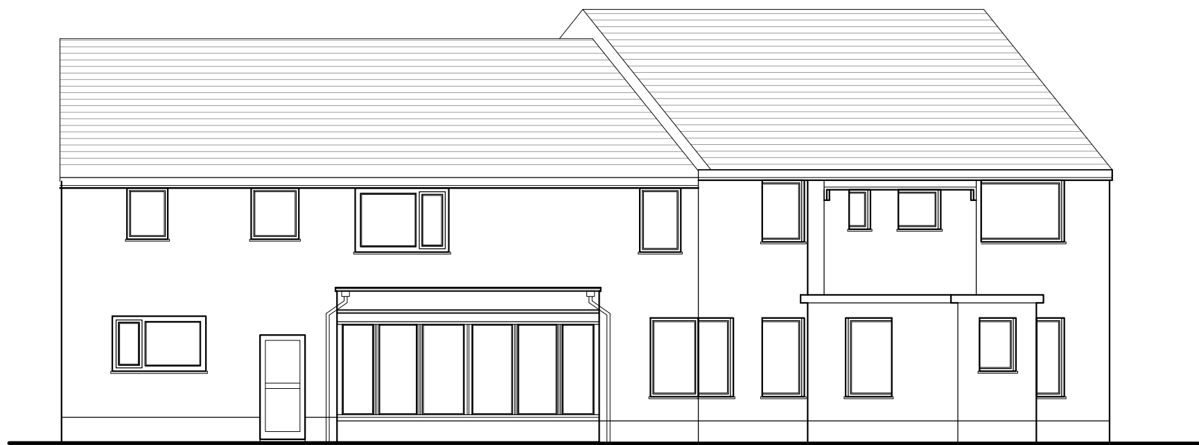
EXISTING REAR (SOUTH EAST) ELEVATION Scale 1:100