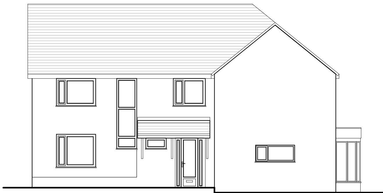
EXISTING FRONT (WEST) ELEVATION Scale 1:100