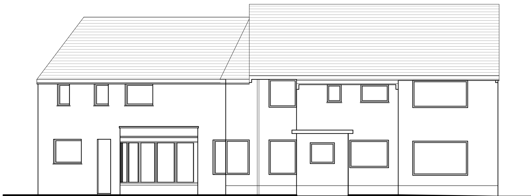
EXISTING REAR (EAST) ELEVATION Scale 1:100