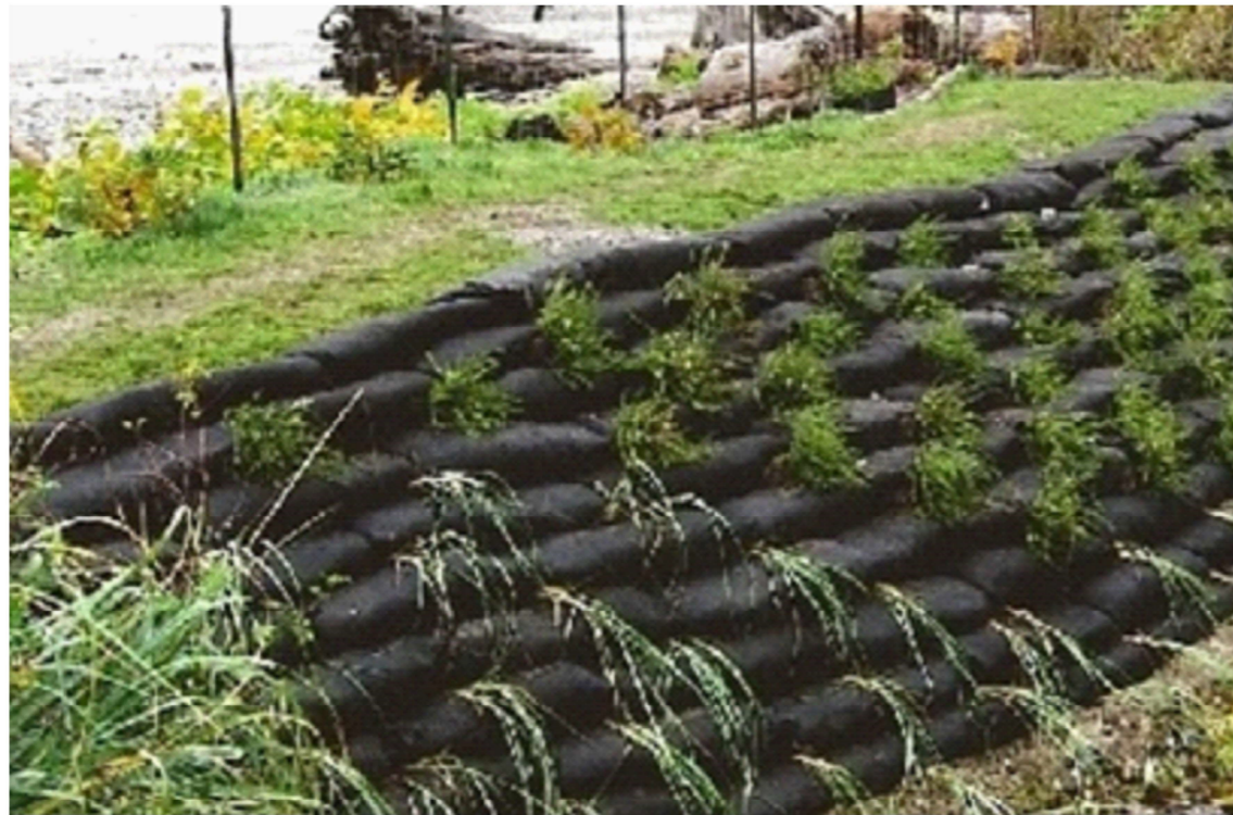
Type C - Green Wall formed with Sand Bags (prior to growth of green wall)