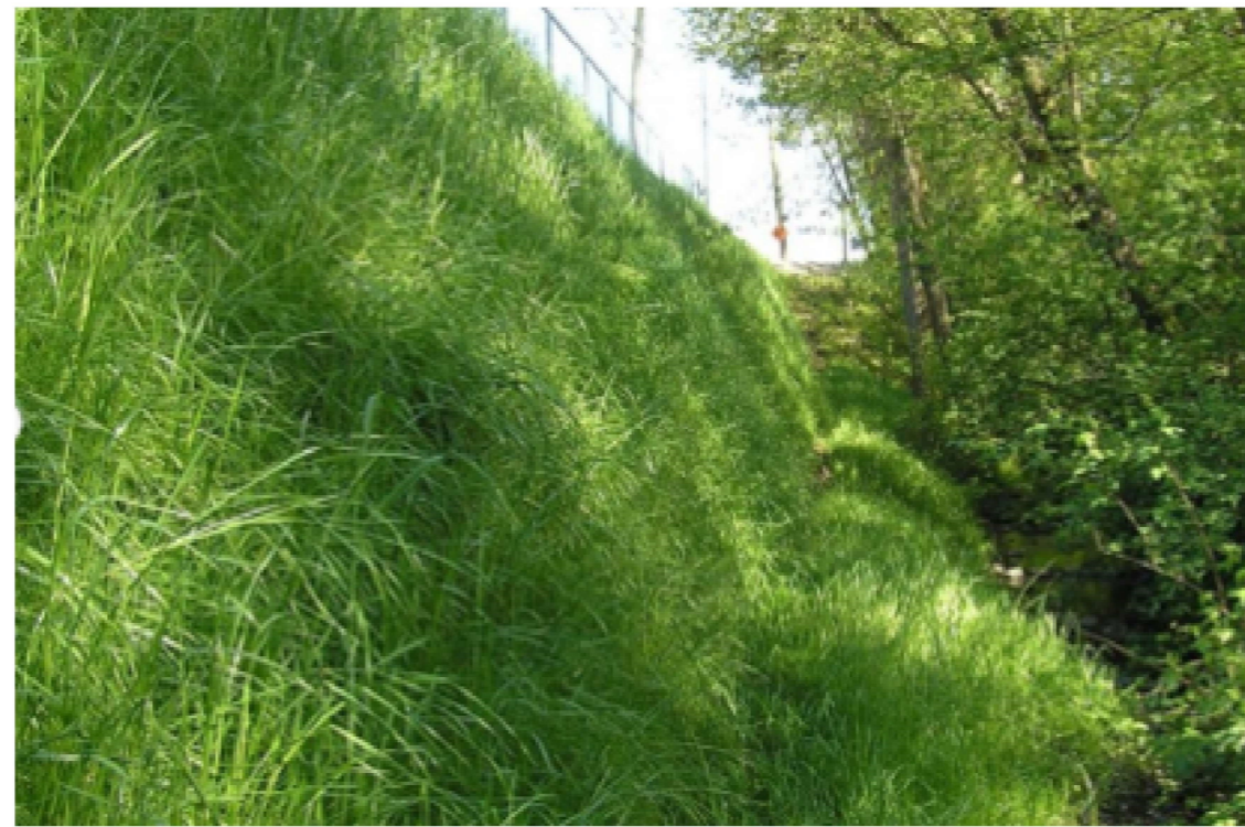
Type C - Green Wall formed with Sand Bags (after growth of green wall)

REV. A - GABION WALL DETAIL REMOVED. SH 18.12.22