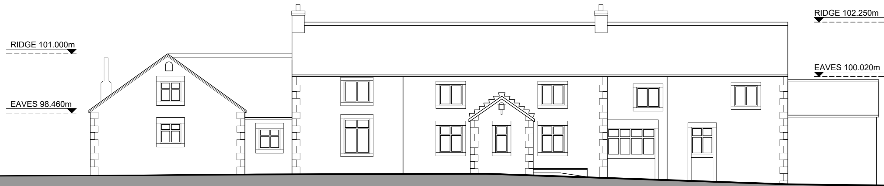
A EXISTING ELEVATION SCALE 1:100 @ A2