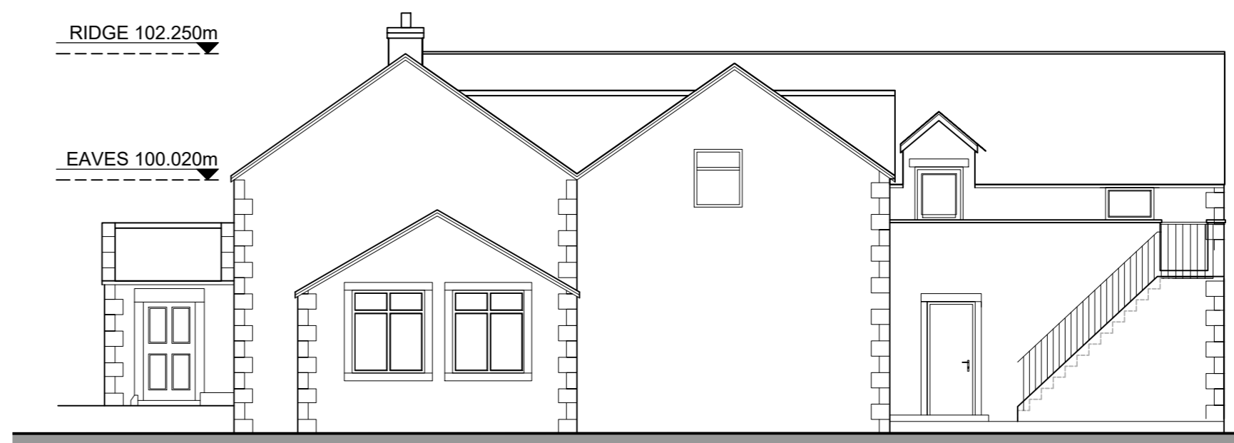
D EXISTING ELEVATION SCALE 1:100 @ A2