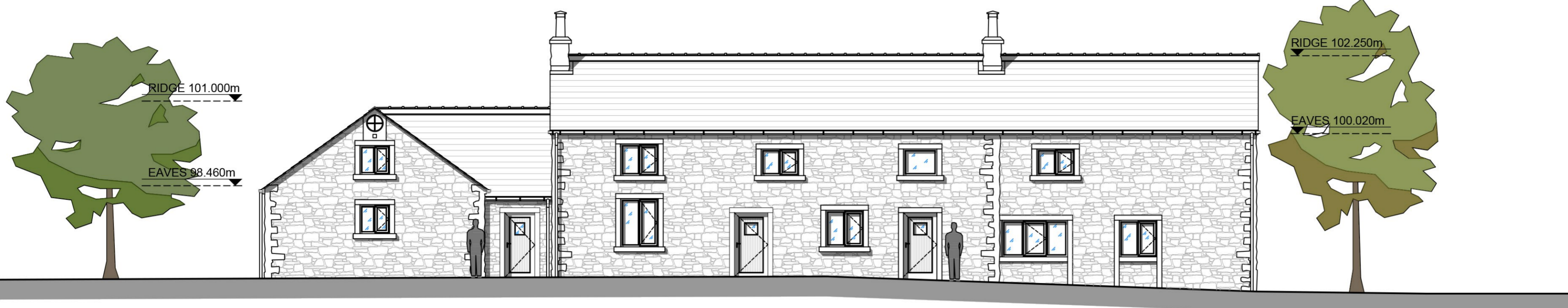
A PROPOSED ELEVATION SCALE 1:100 @ A2