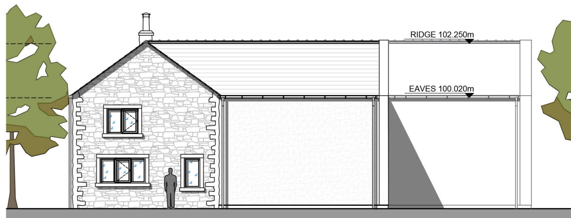
D PROPOSED ELEVATION SCALE 1:100 @ A2