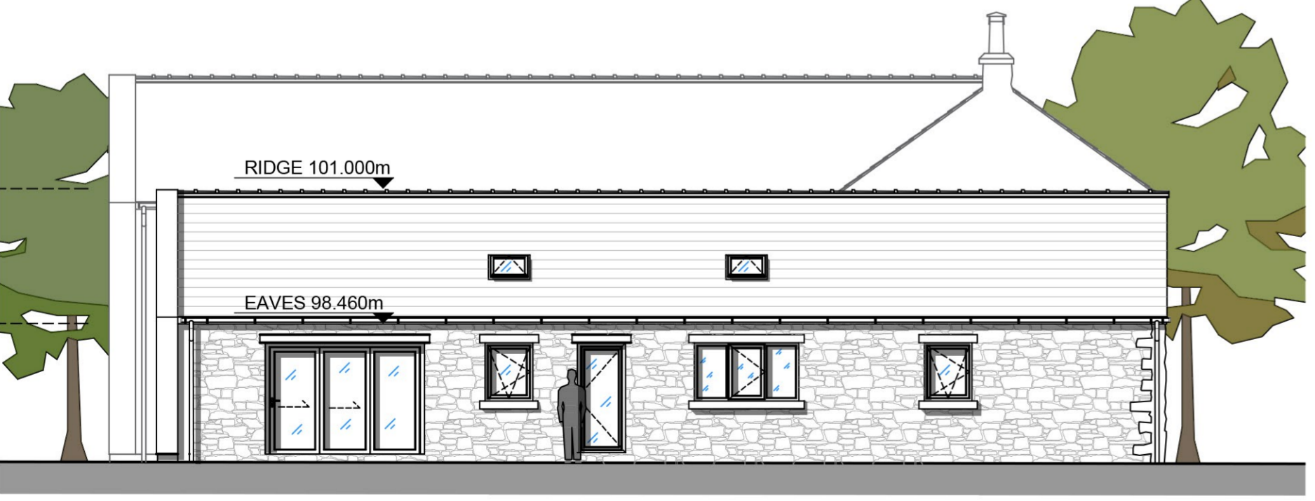
C PROPOSED ELEVATION SCALE 1:100 @ A2