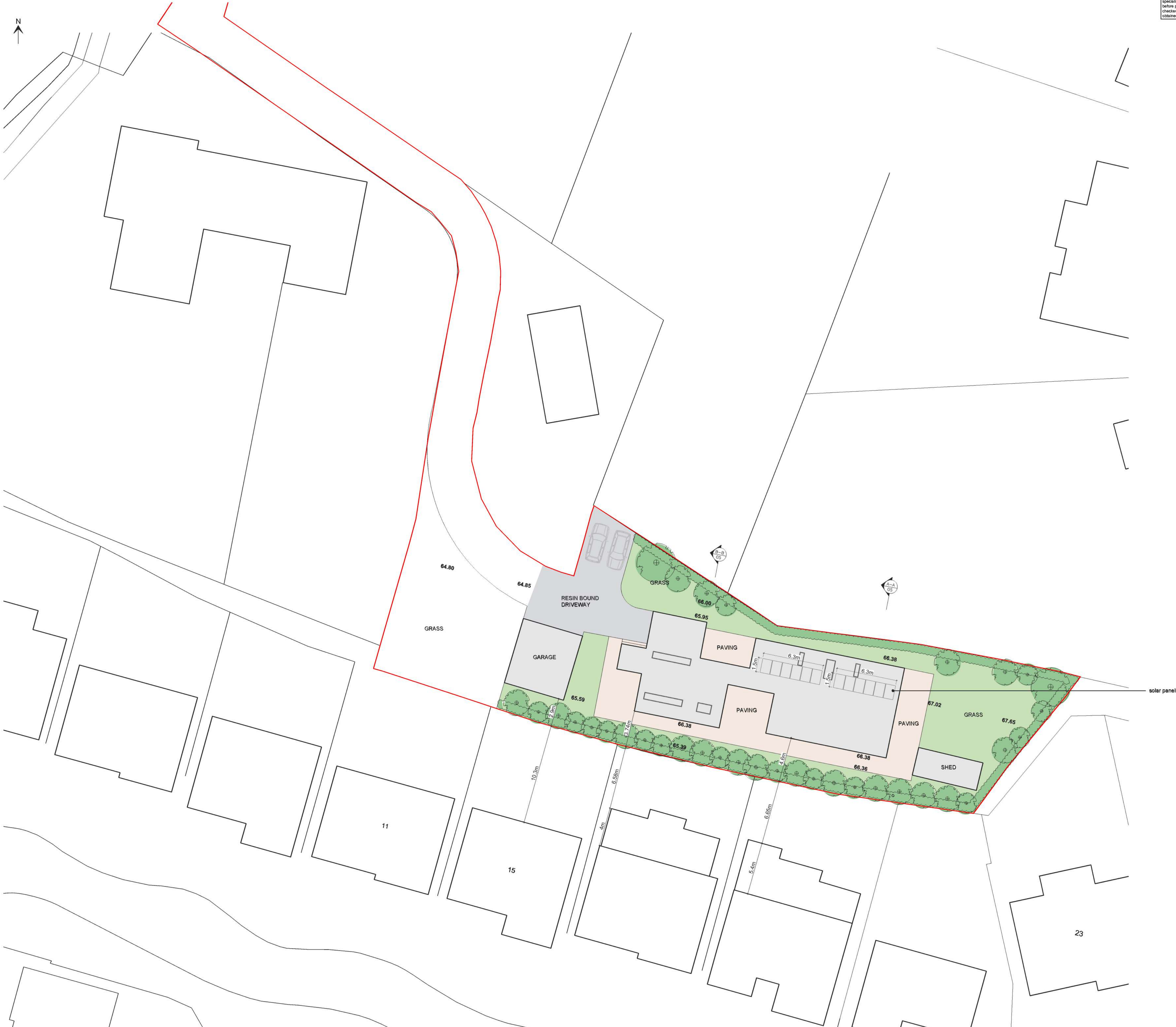
PROPOSED SITE PLAN Scale 1:200

DRIVEWAY: Resin bound aggregate, provisional subject to specialist resin bound surfacing installer, hand trowelled to a smooth finish with an aggregate size of 2-5 mm is 18 mm and 1-3 mm is a 12 mm deep layer. Open surface course of tarmacadam 50 mm minimum of AC 14 open surf max 100/150 pen to BS EN 13108-1:2006 (Bituminous Macadam) MOT Sub Base laid in one or more well compacted layers 150 mm minimum depth of well compacted Mot Type 3 granular sub base 4/40 mm, 4020mm graded crushed concrete aggregate to EN 12620, or locally available secondary or recycled aggregates which comply with the requirements, blinded with 2/6.3mm graded crushed concrete aggregate to EN 12620. A geotextile membrane to prevent upward migration of fine soil particles above substrate.