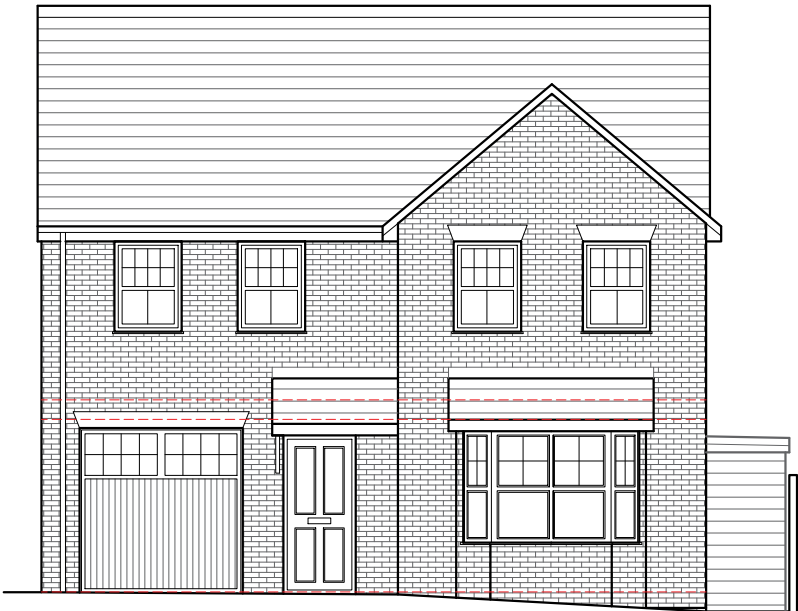
Existing West Facing Elevation Scale 1:100