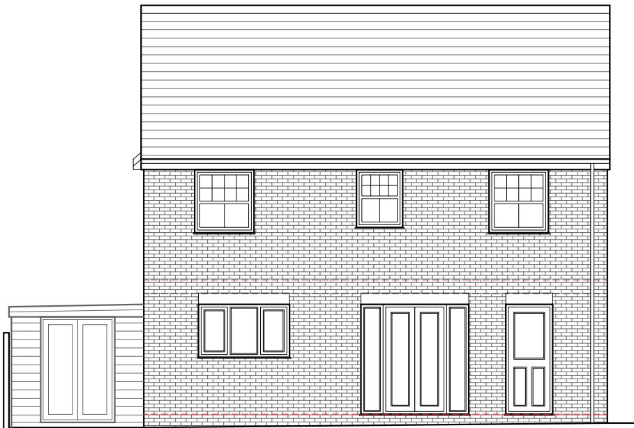
Existing East Facing Elevation Scale 1:100

A BWT Amended following planners comments 05.04.2023