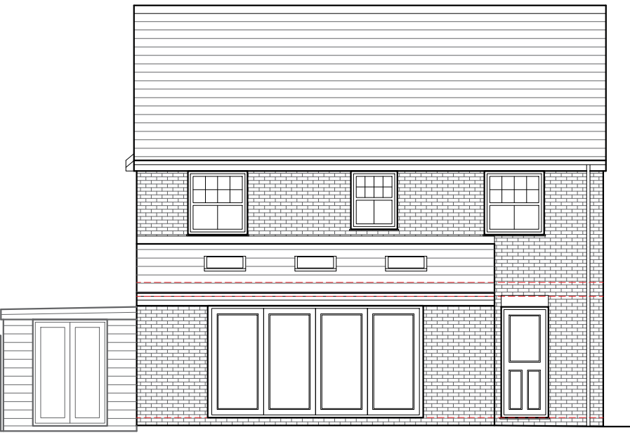
Proposed East Facing Elevation Scale 1:100

A BWT Amended following planners comments 05.04.2023