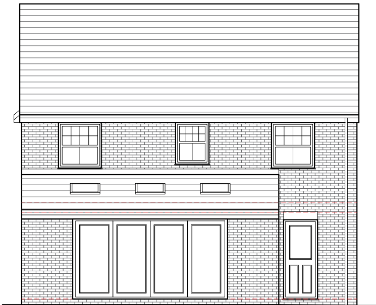
Proposed East Facing Elevation Scale 1:100

Client Mr and Mrs Street Job Title Proposed Alterations and Extensions to 12 Hollin Hall Drive Longridge