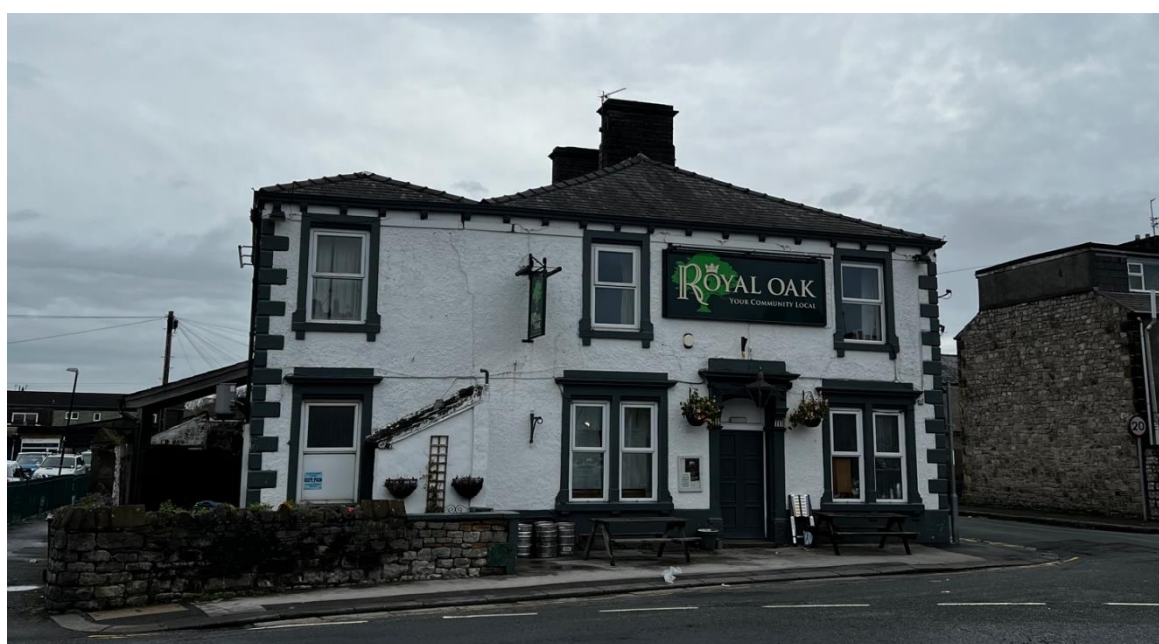
Figure 3 – Existing Front Elevation

The site's main access is directly from Waterloo Road; however, there is also ancillary access from Salthill Rd and through a rear door accessible via the smoking area. The site has good road connections to the surrounding areas, including the town centre, the A59, and the M65 and M6 motorways. There is also a regular bus service that runs along Waterloo Road, providing access to other parts of Clitheroe and the surrounding area. In addition to the bus service, the local train station is a short walk away (0.4 miles). The existing site can therefore be seen as sustainable in terms of access.