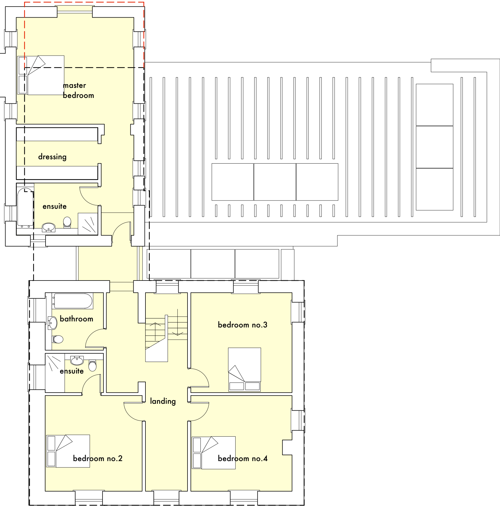
first floor plan