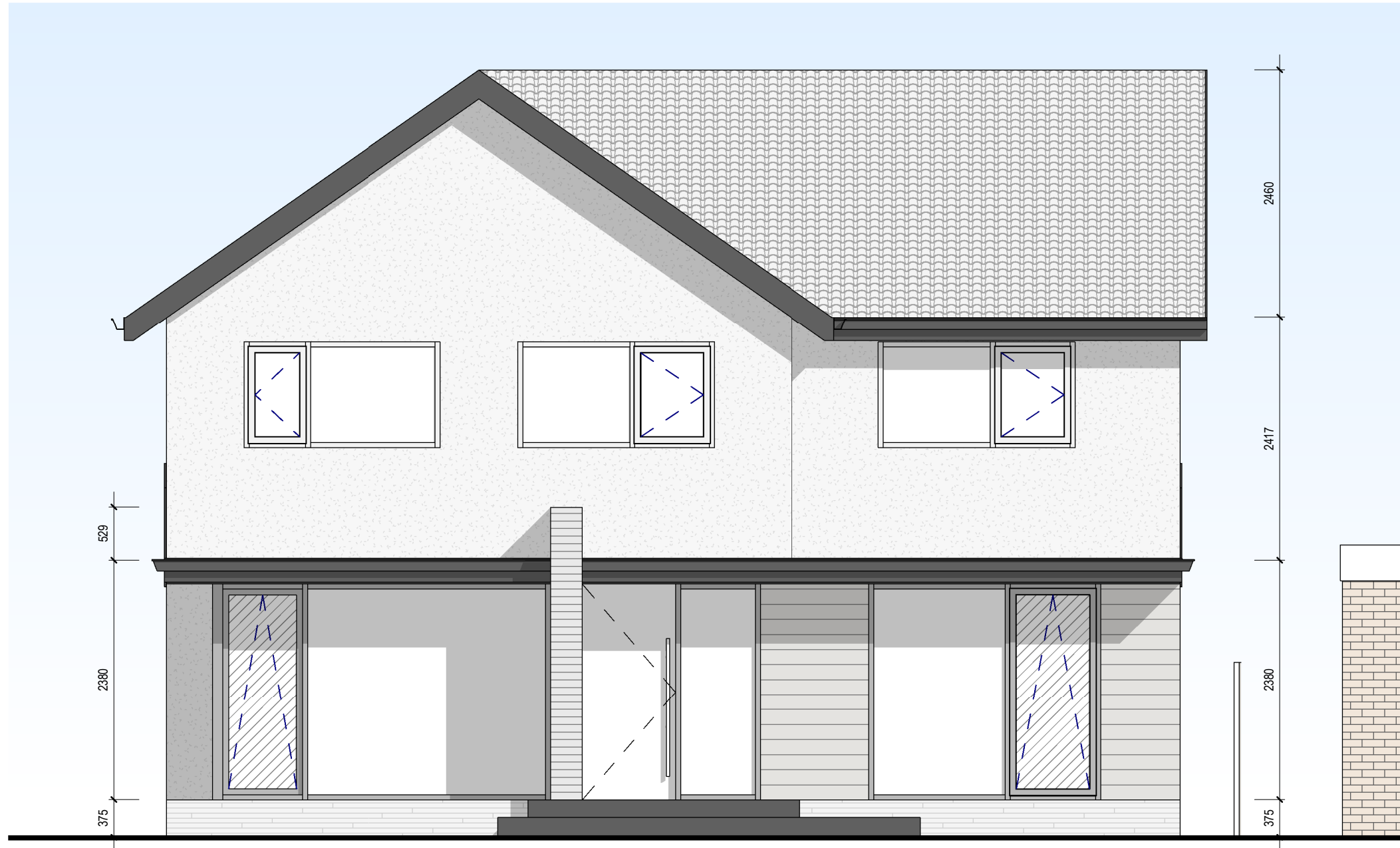
4 West Elevation 1 : 50