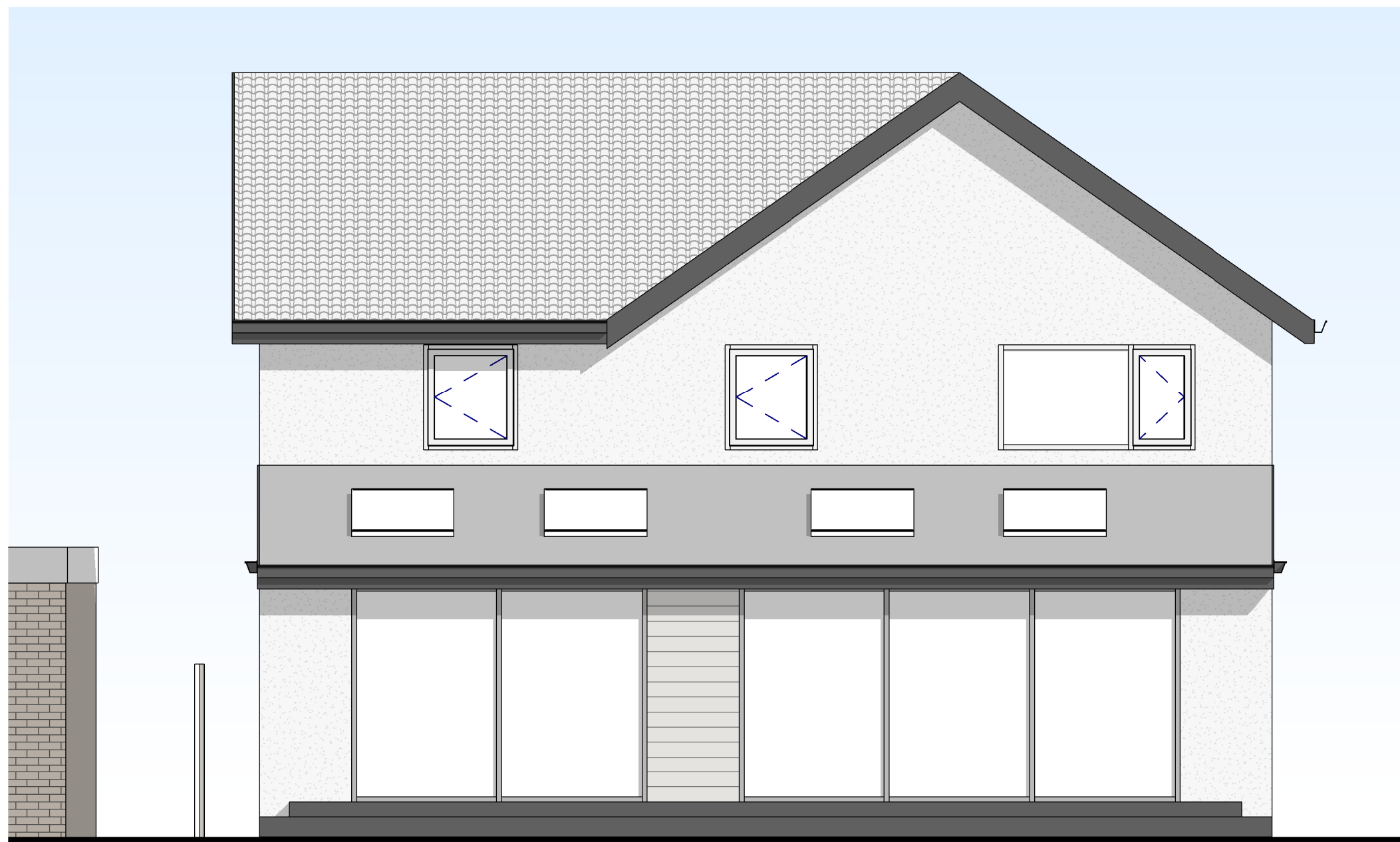
1 East Elevation 1 : 50