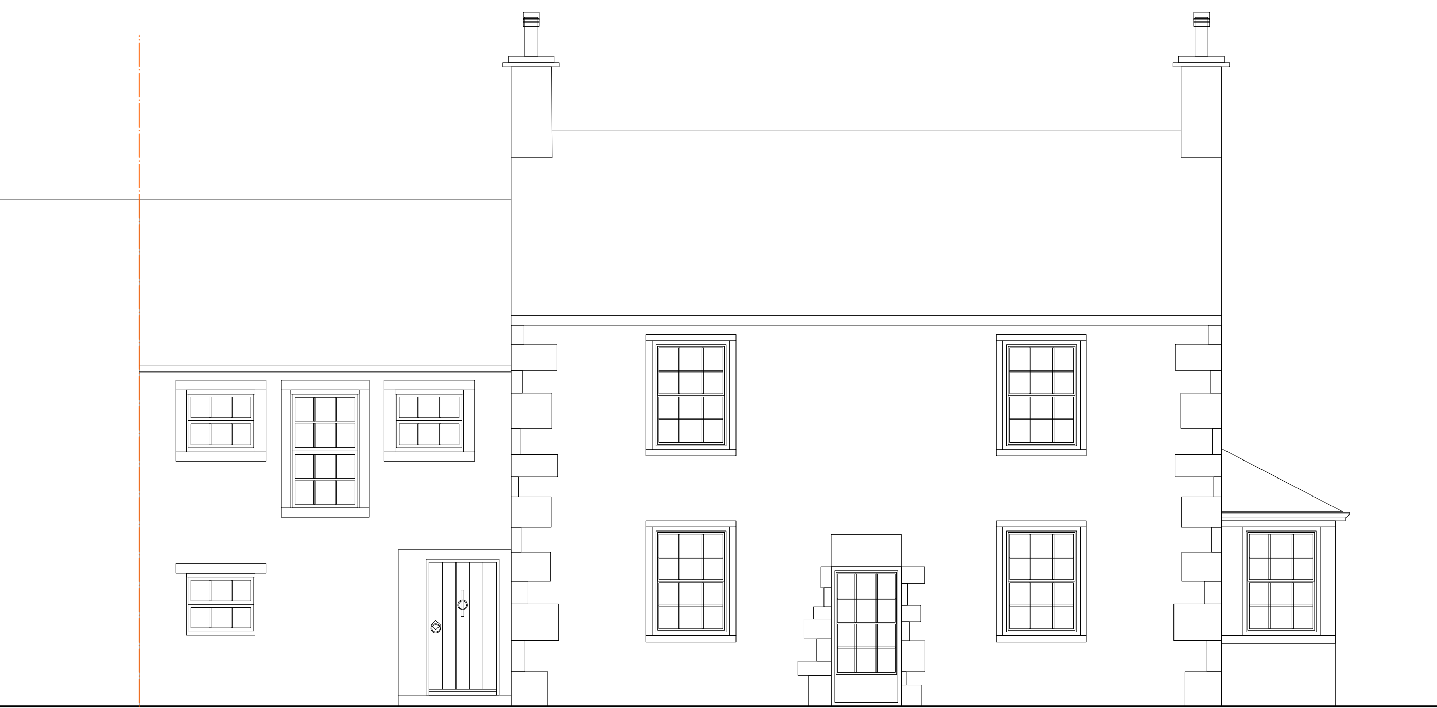
1 Proposed Elevation A 1:50 @ A1