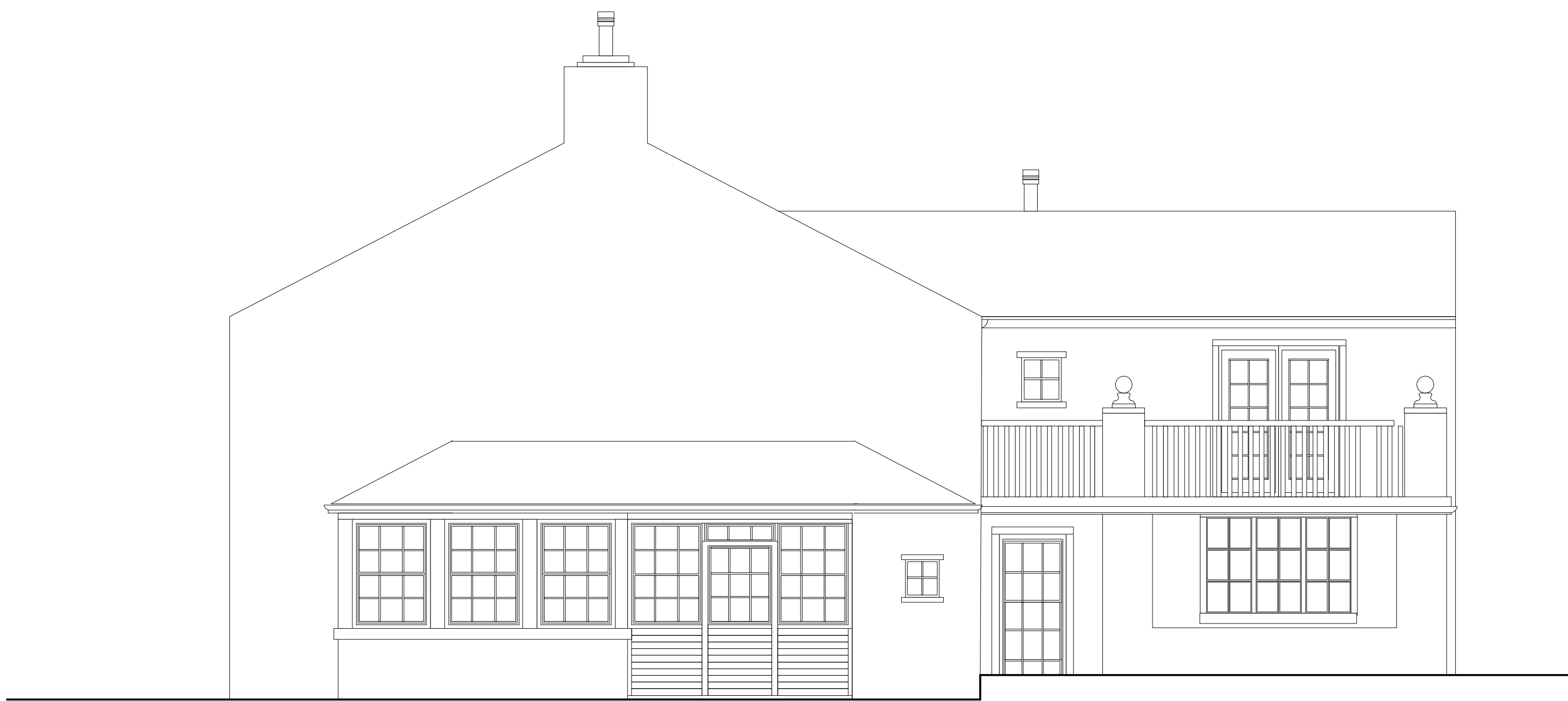
2 Proposed Elevation B 1:50 @ A1