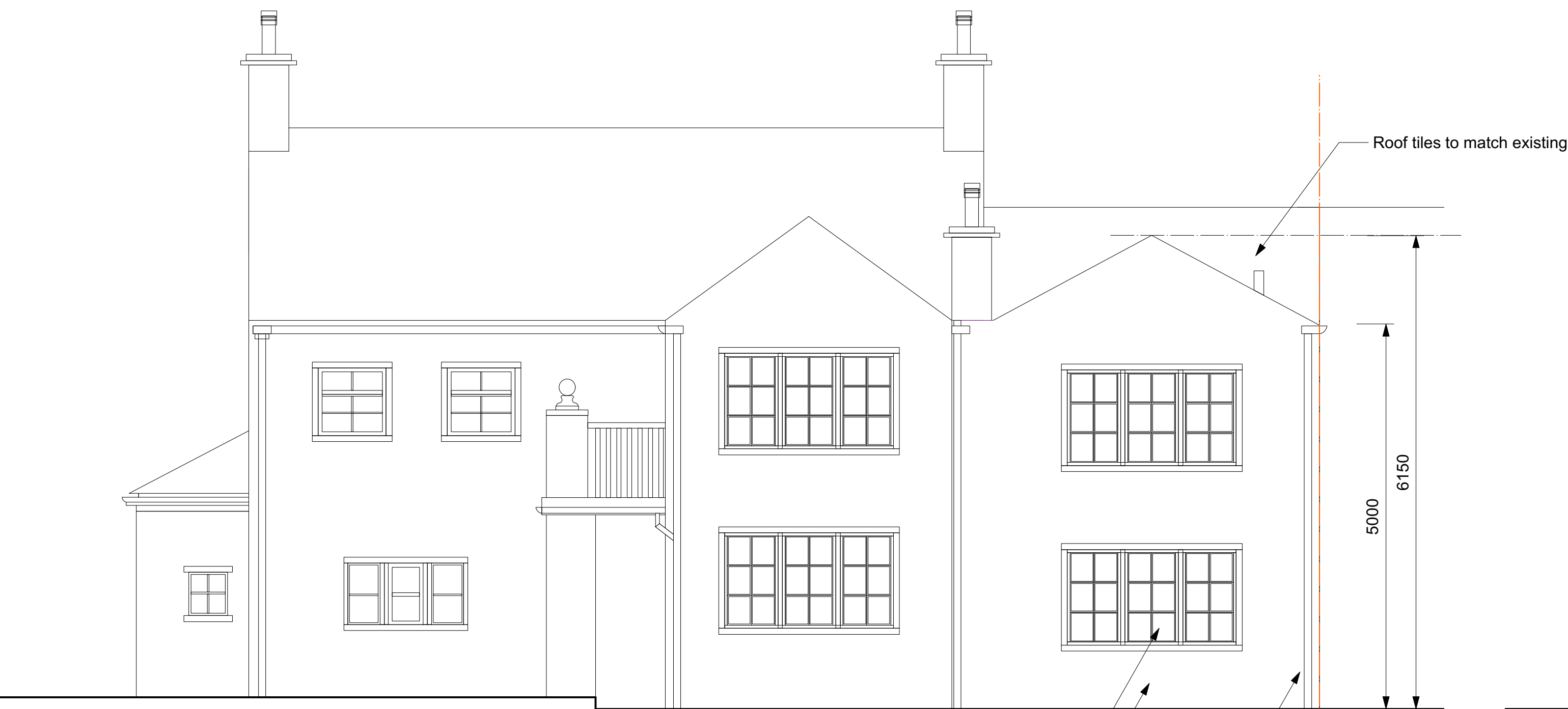
3 Proposed Elevation C 1:50 @ A1

Roof tiles to match existing Painted timber frame windows, stone surrounds to match existing Heritage stone finish to match existing Black cast iron downpipes and guttering