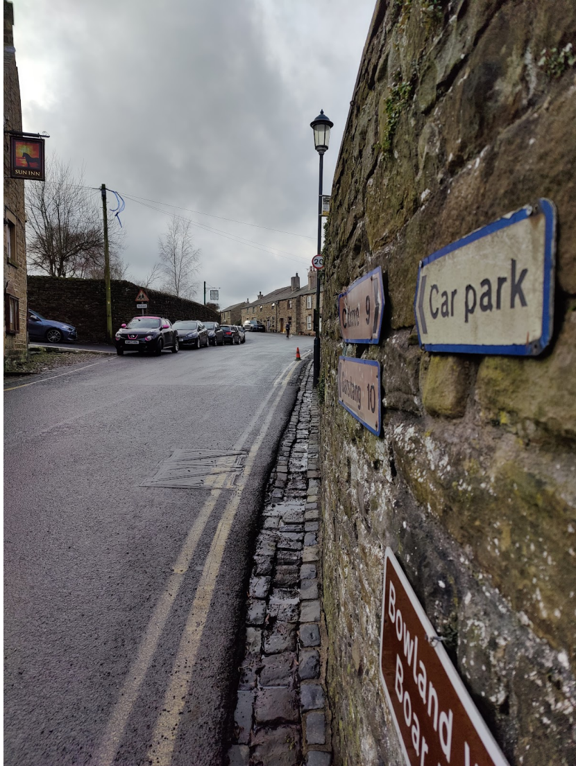
Plate 7 View of traffic cones from point C (Outside new Access in Gully)