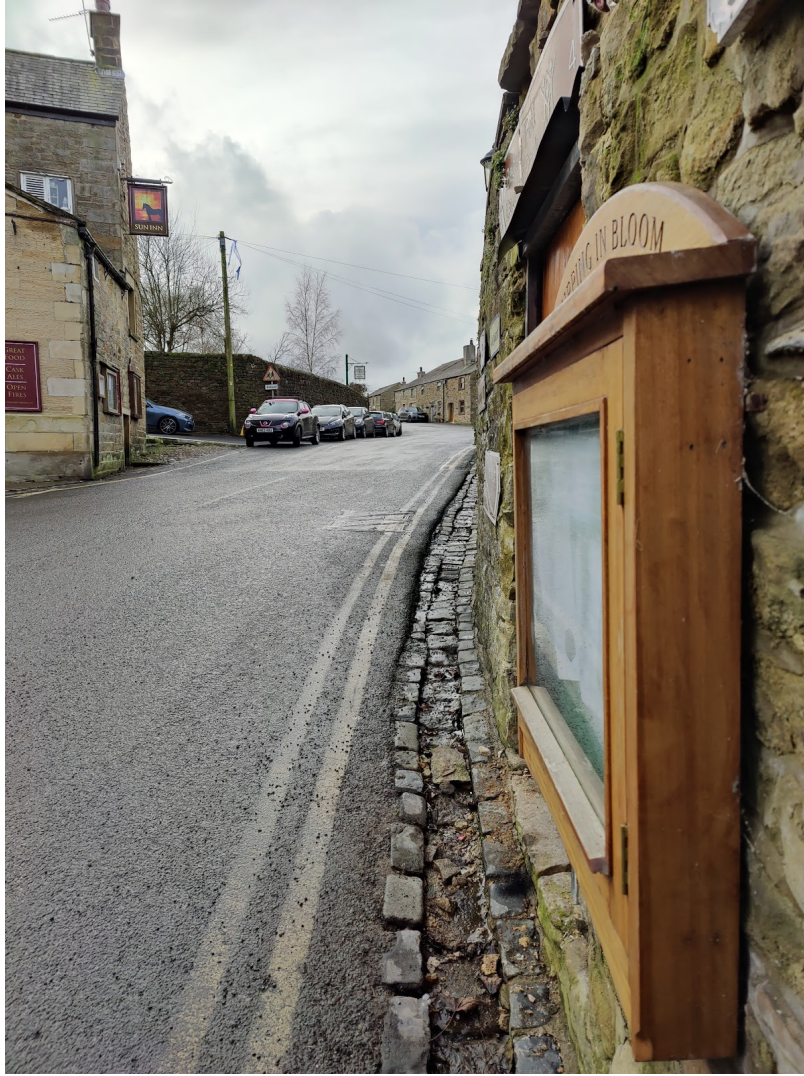
Plate 6 View of traffic cones from point A (Outside existing access in gully)