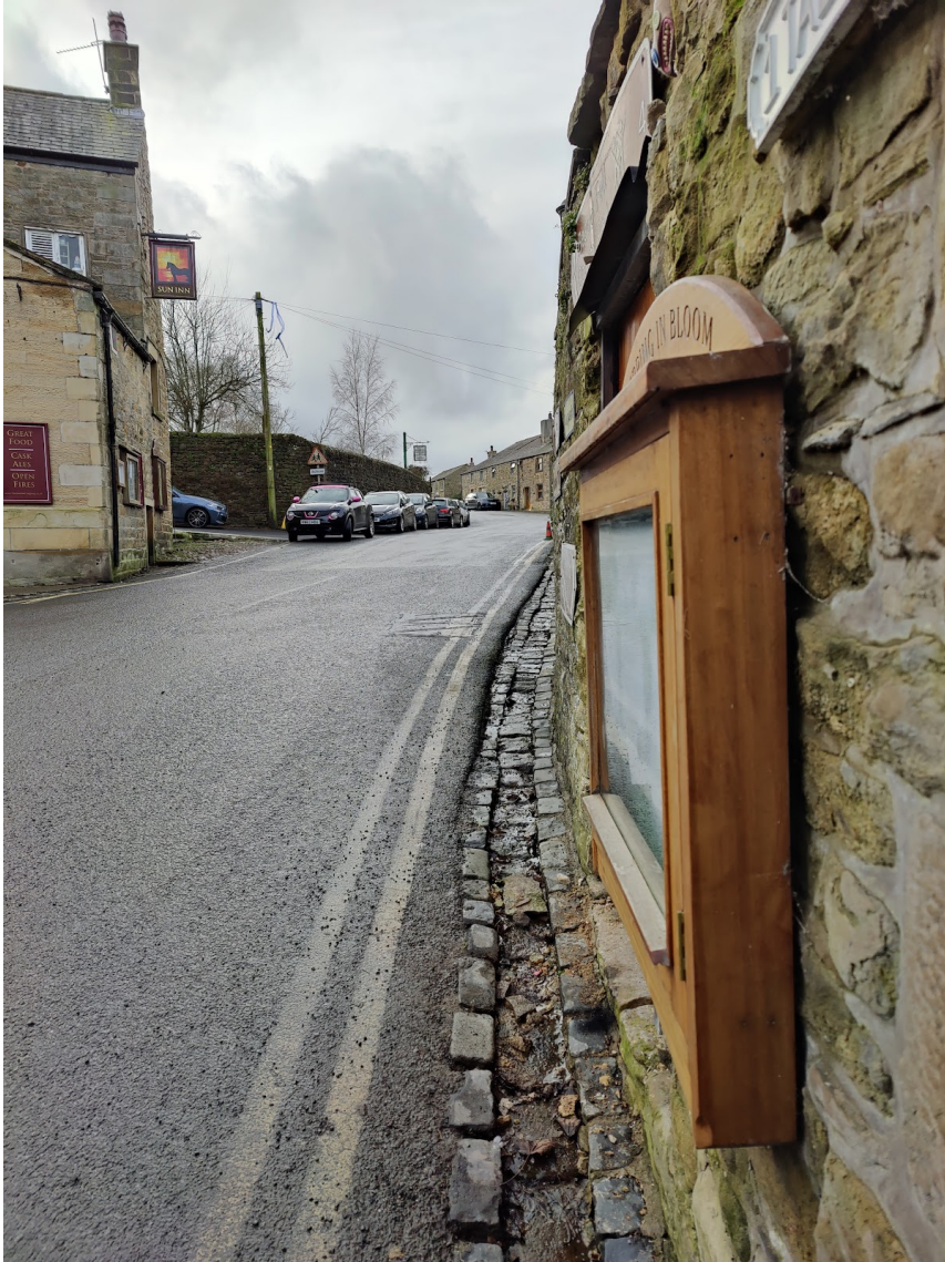
Plate 4 View of two traffic cones viewed from point B (Outside existing access)