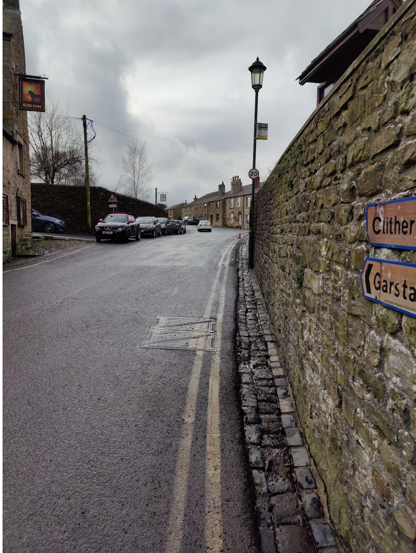
Plate 3 View of two traffic cones viewed from point D (outside new access)