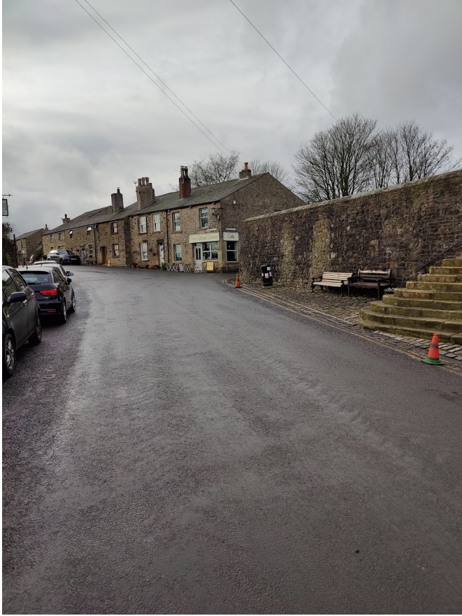
Plate 5 View of traffic cones in position of plate 3 and 4