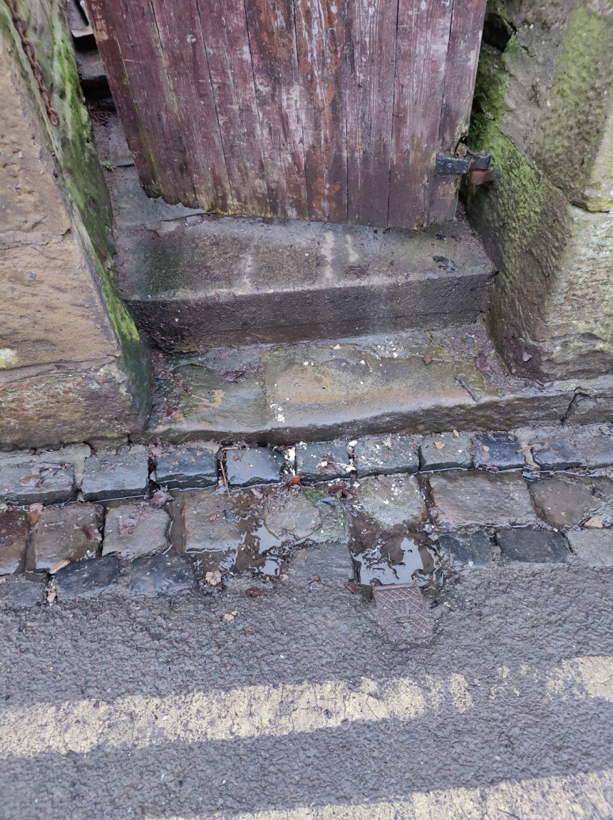
Plate 1 View of the road outside the gate of 1 Talbot St