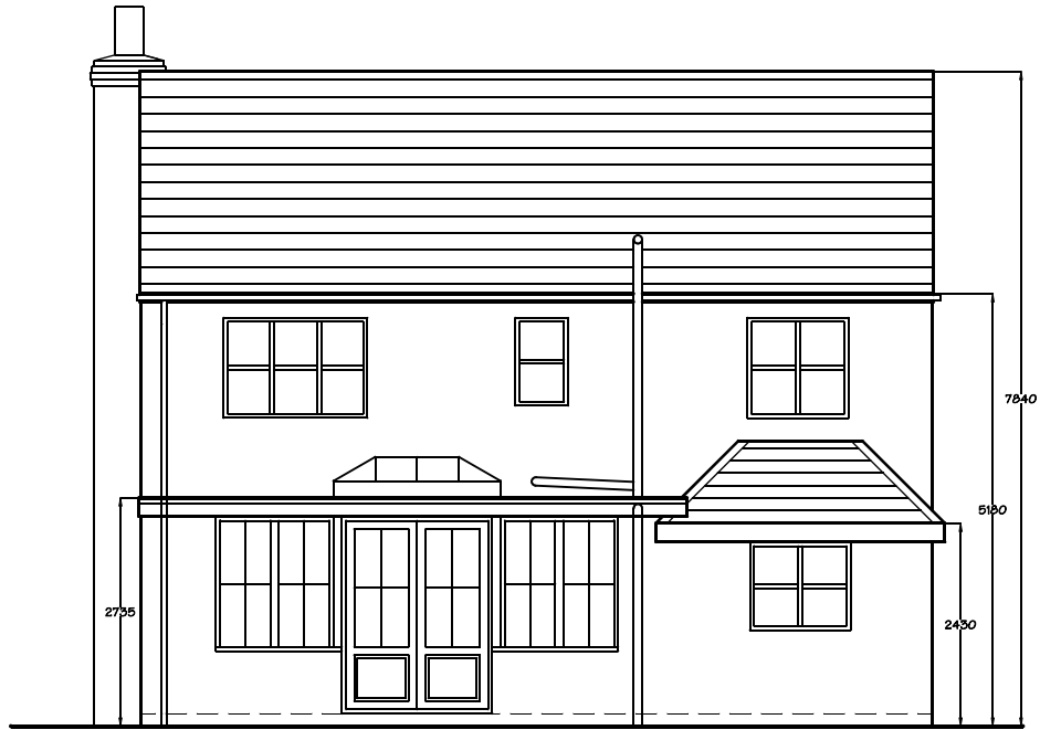
Rear Elevation (west)