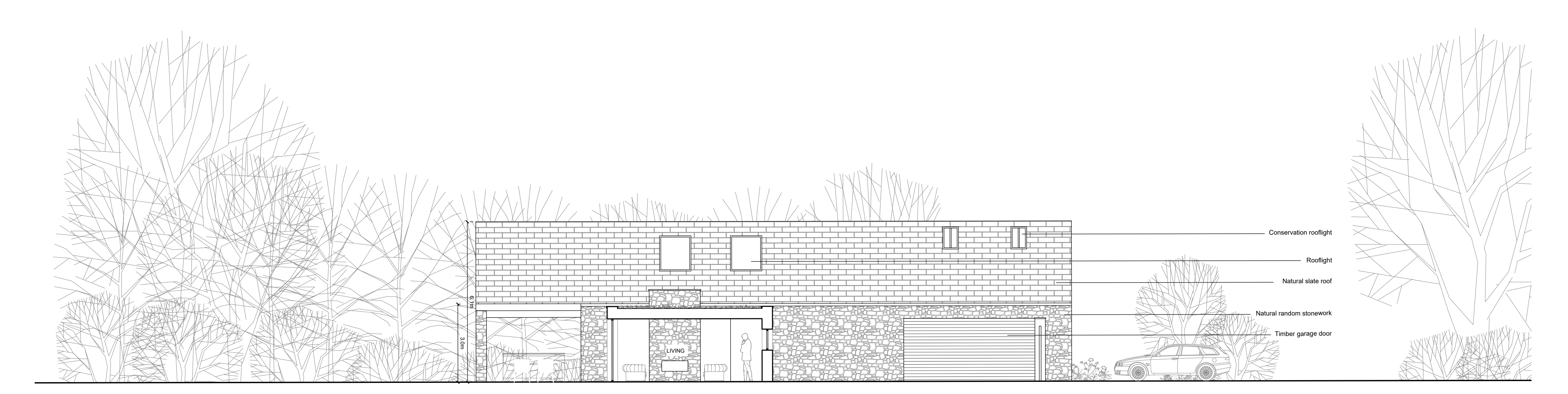
East Section / Elevation Scale 1:100