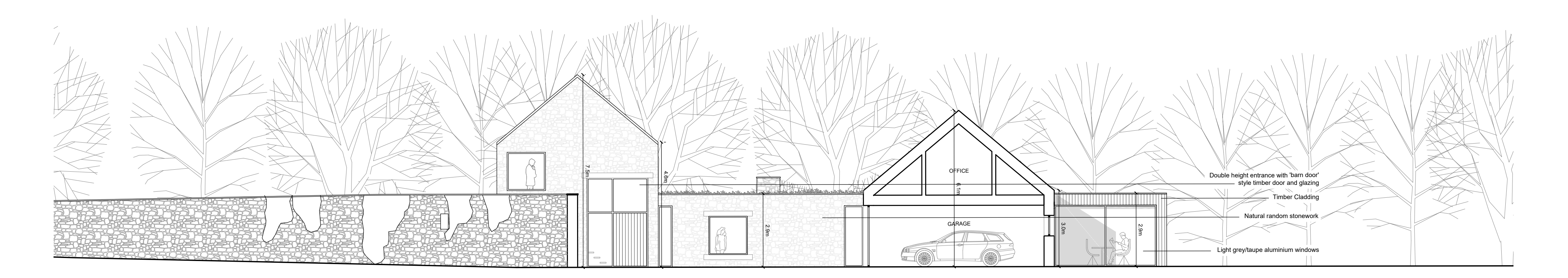
North Section / Elevation Scale 1:100