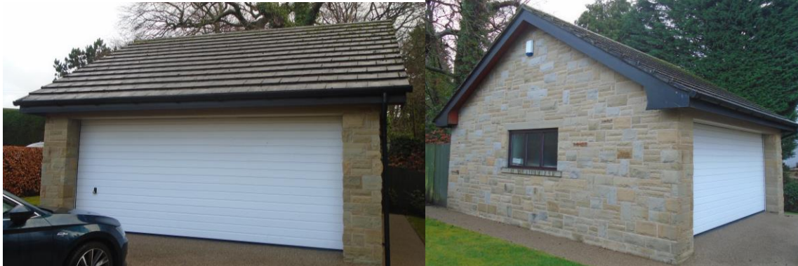
Front west elevation

The building is a detached garage within the curtilage of a dwelling. The garage is approx. 20 years old.