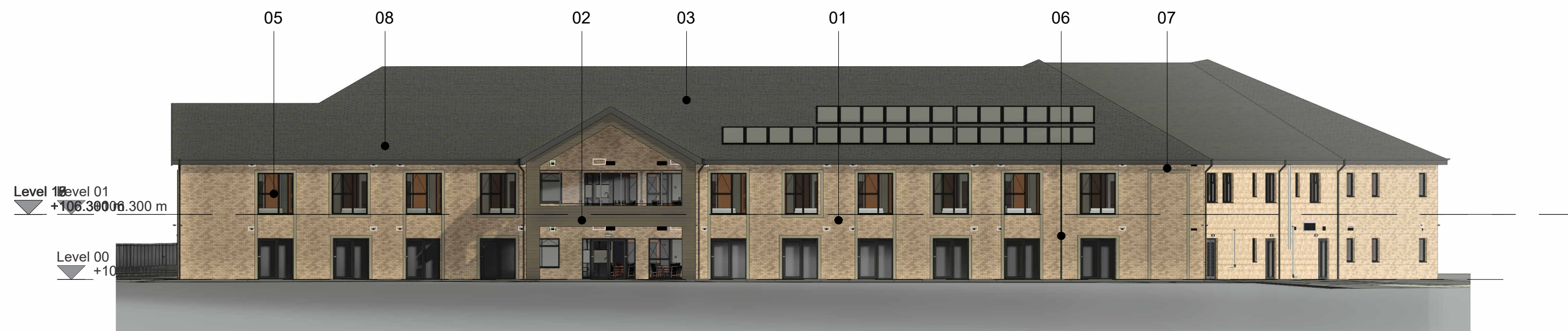
Elevation C-C (East)