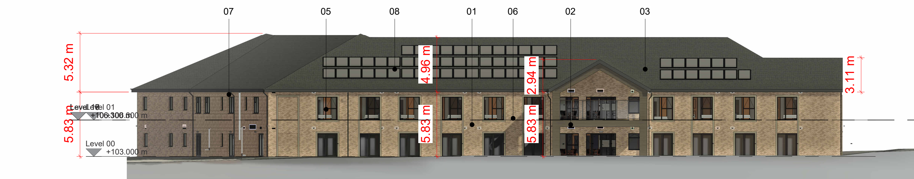
Elevation A-A (West)