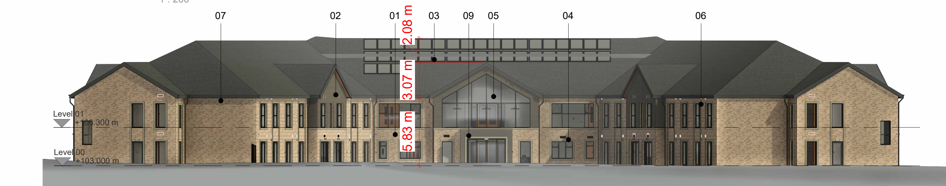
Elevation B-B (South)