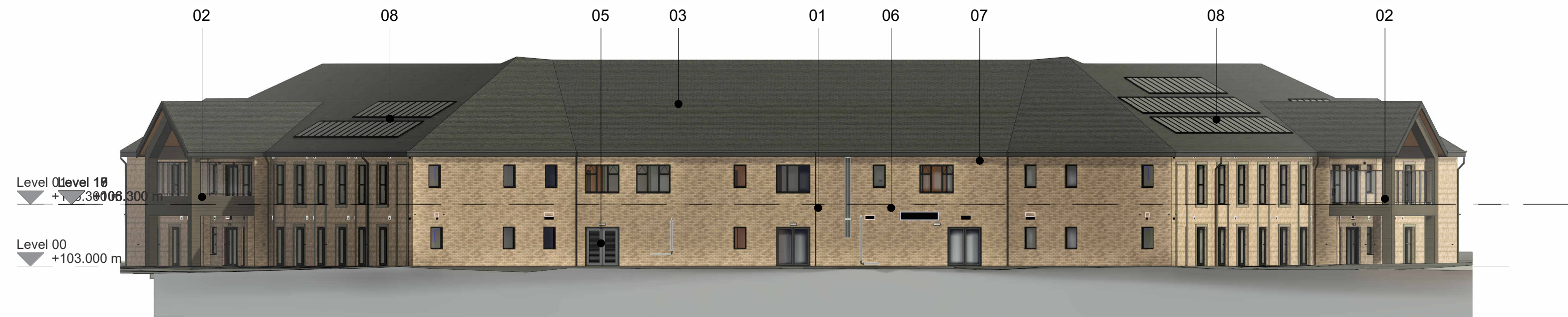
Elevation D-D (North)