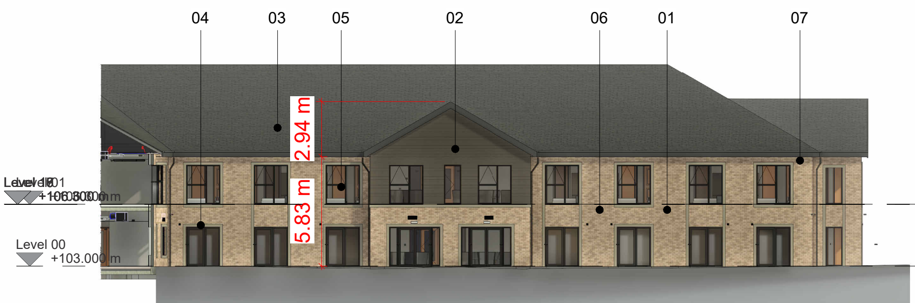
Elevation F-F (Inside Facing West)