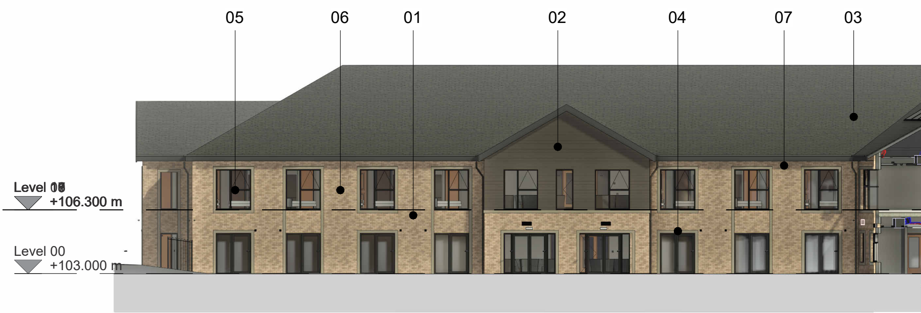
Elevation E-E (Inside Facing East)