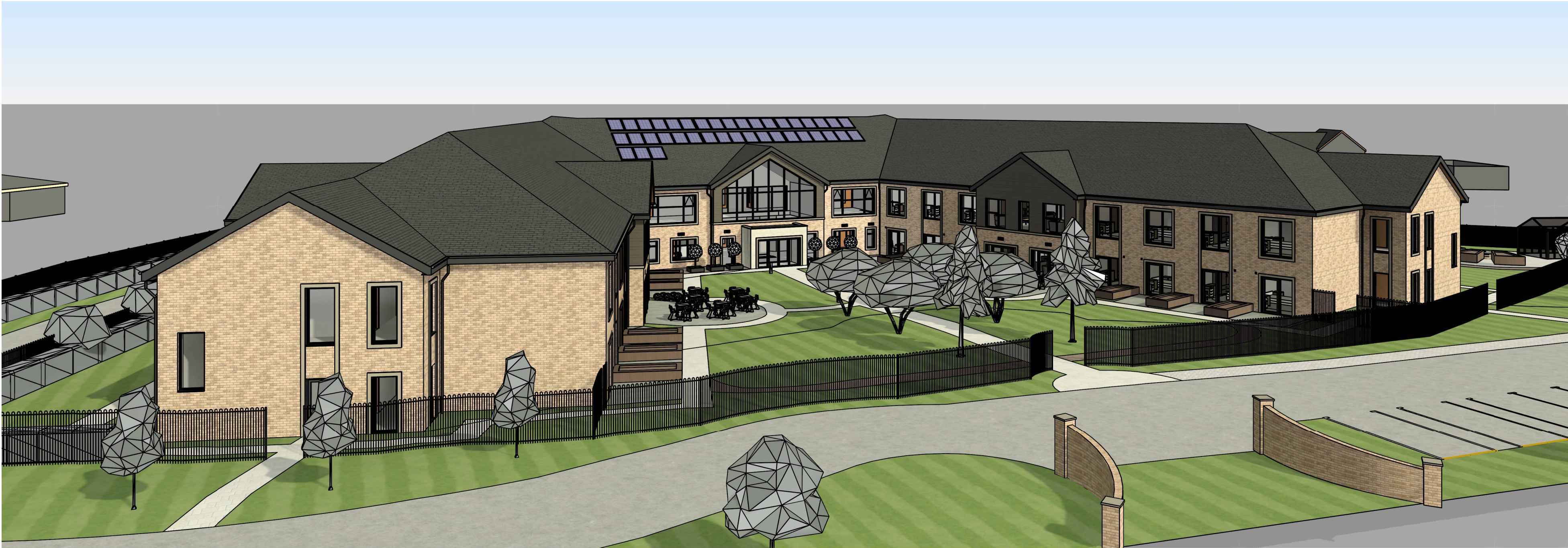
3D Visual 4