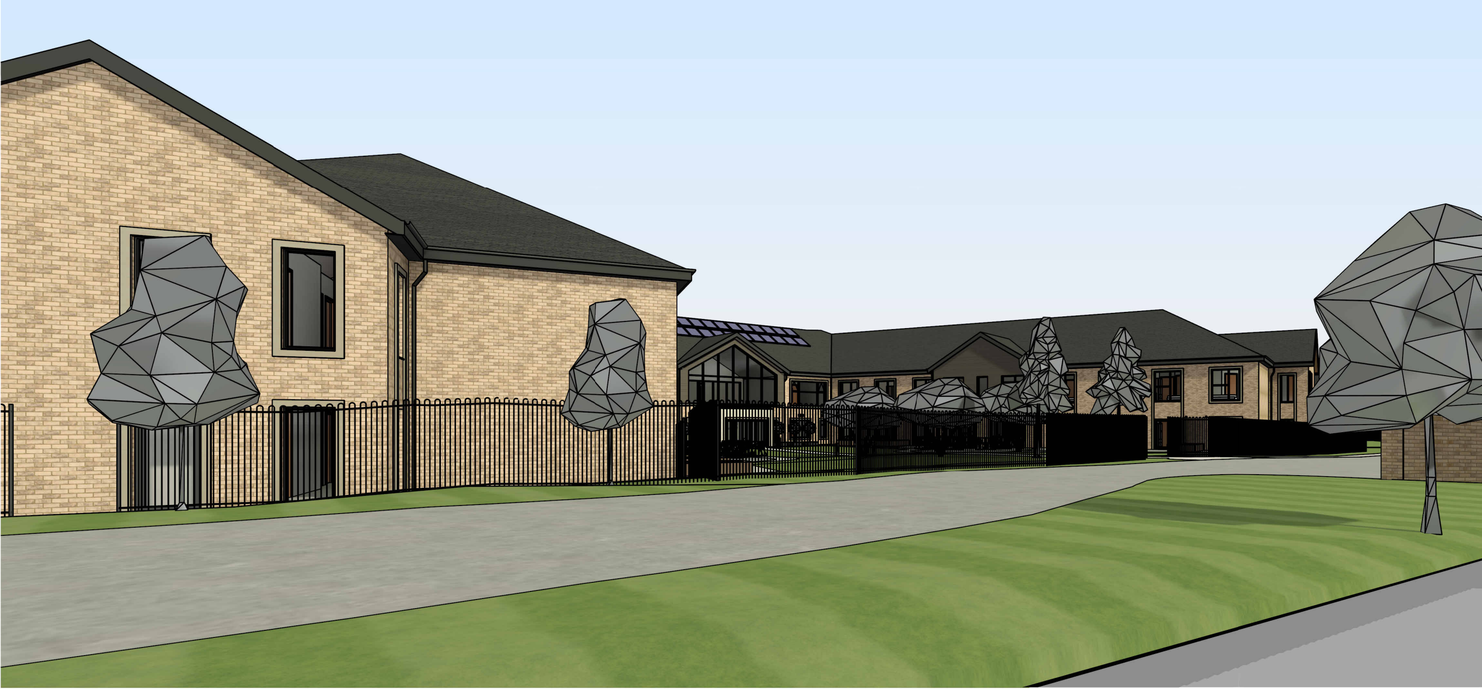
3D Visual 6