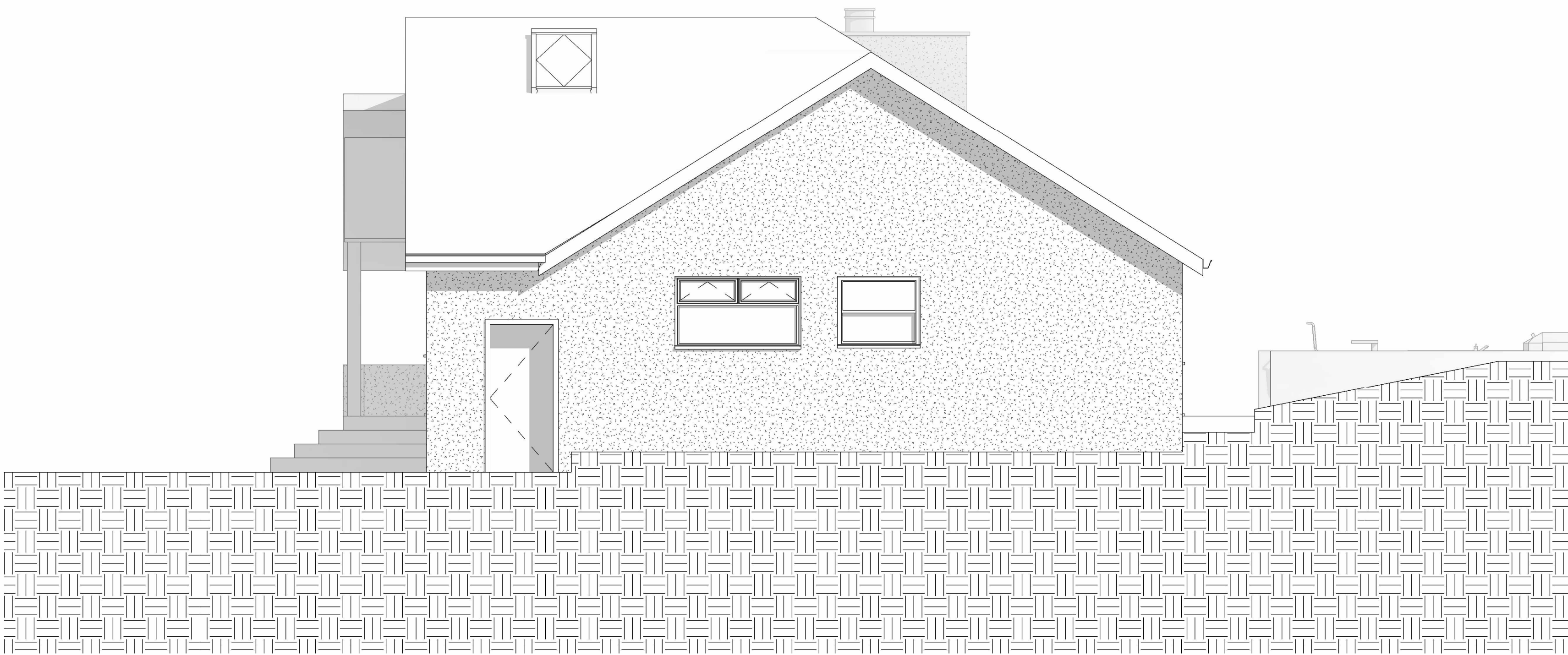
2 PROPOSED WEST 1 : 50