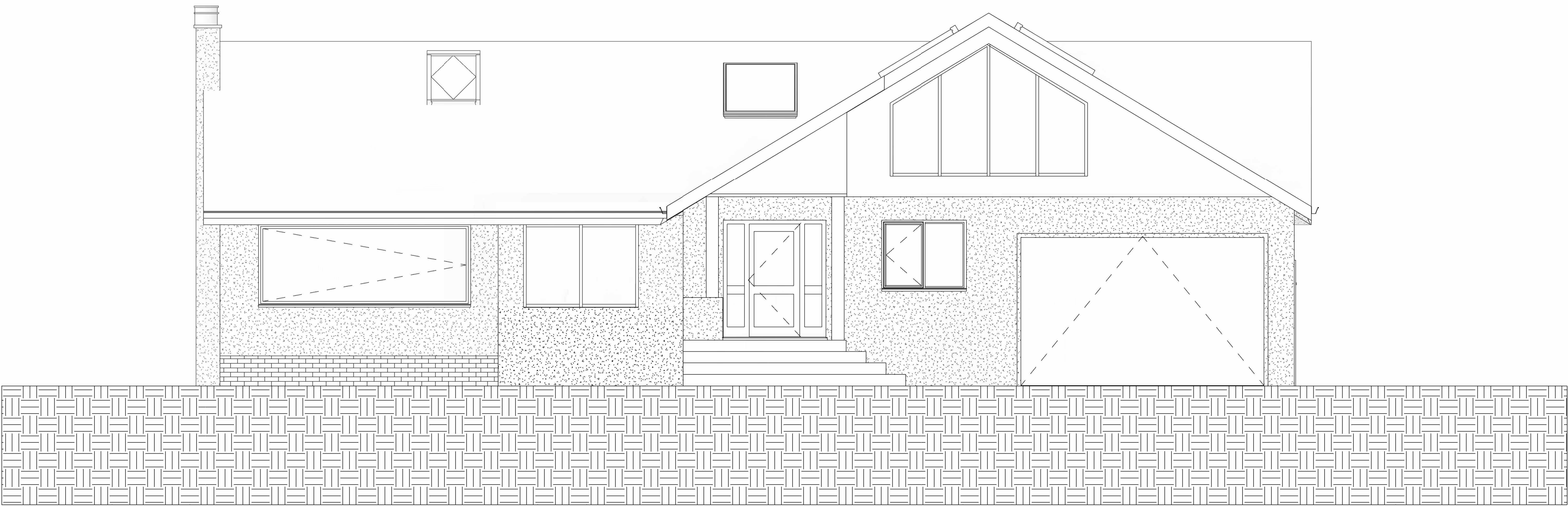
3 PROPOSED NORTH 1 : 50