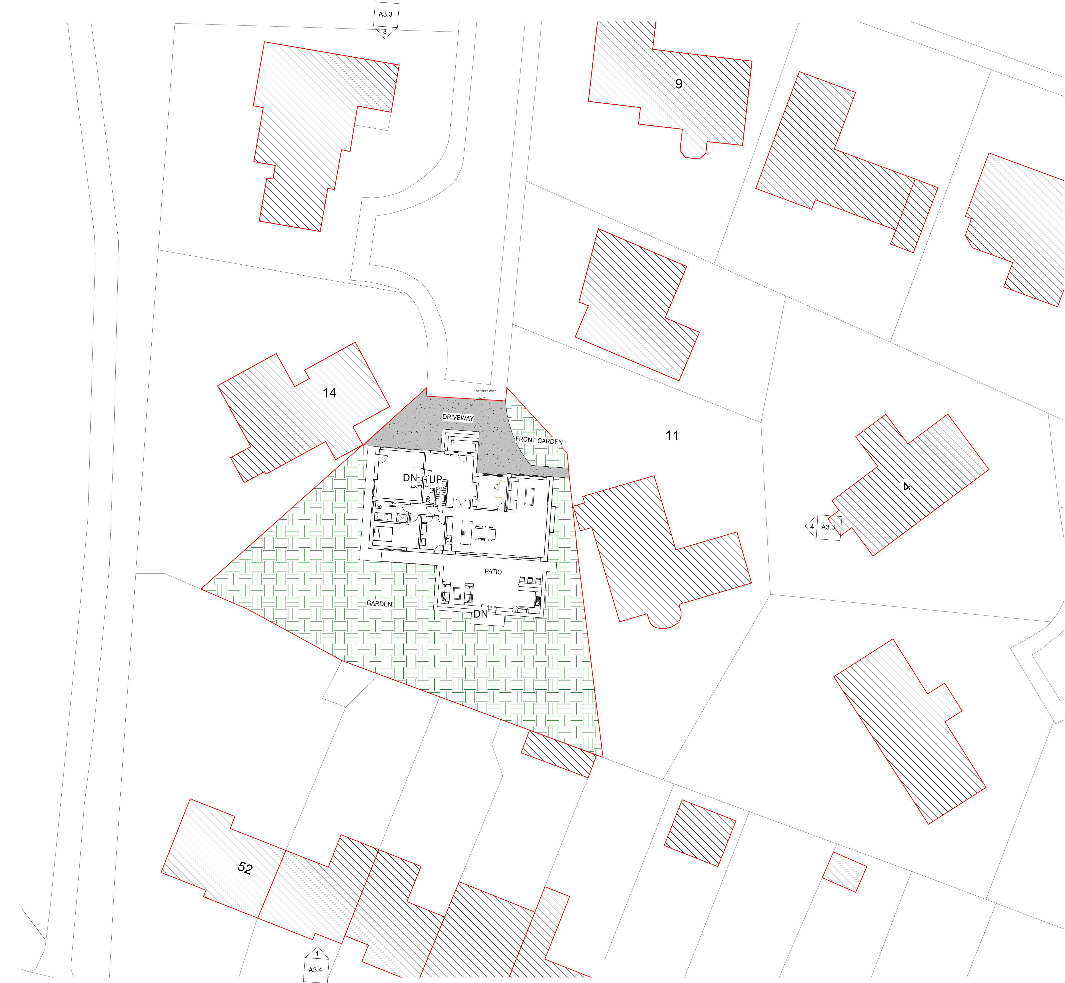
1 PROPOSED SITE PLAN 1 : 200