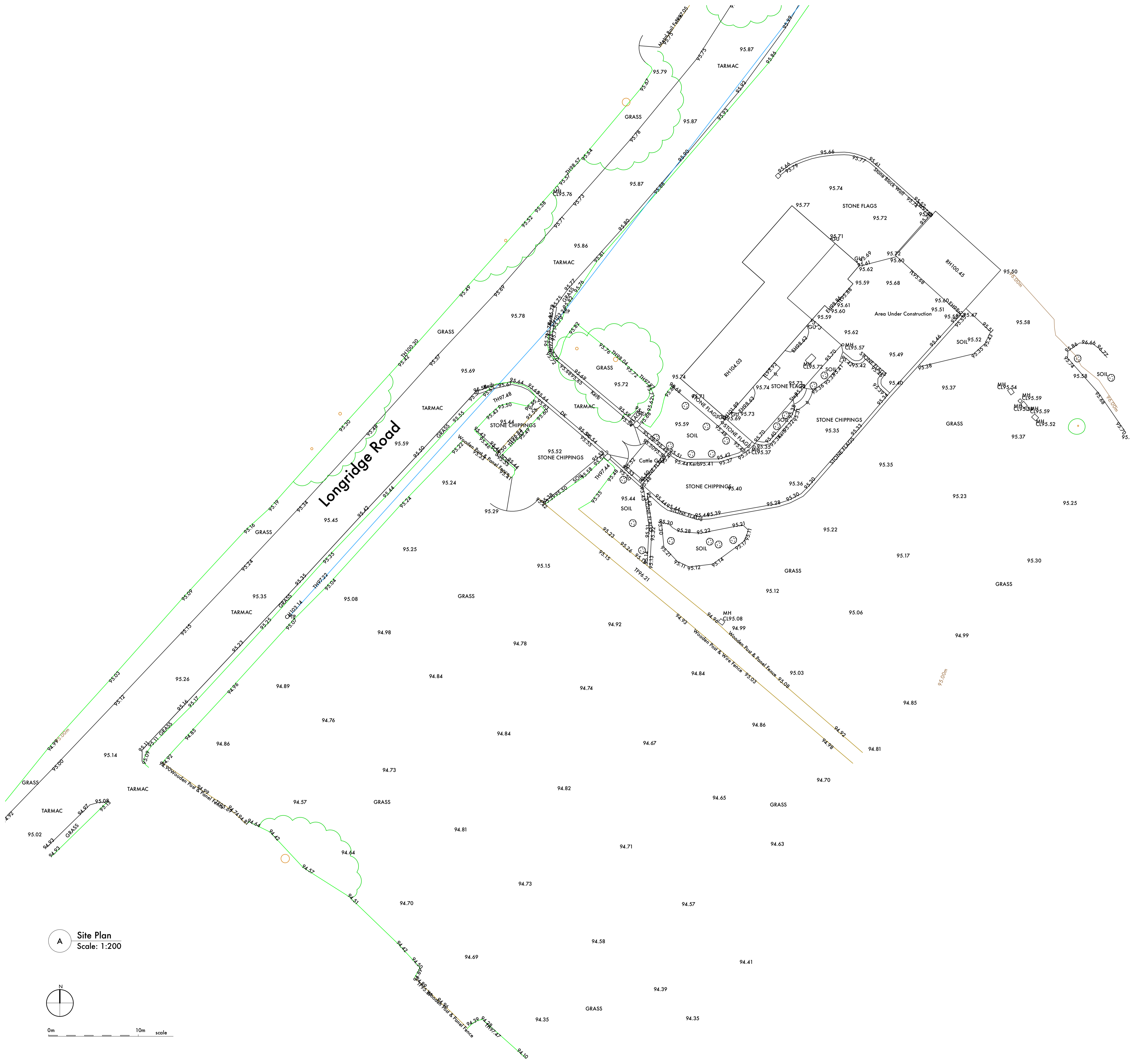
A Site Plan Scale: 1:200