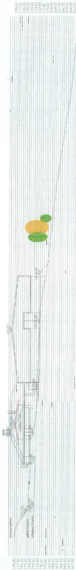
SECTION C-C 1:200