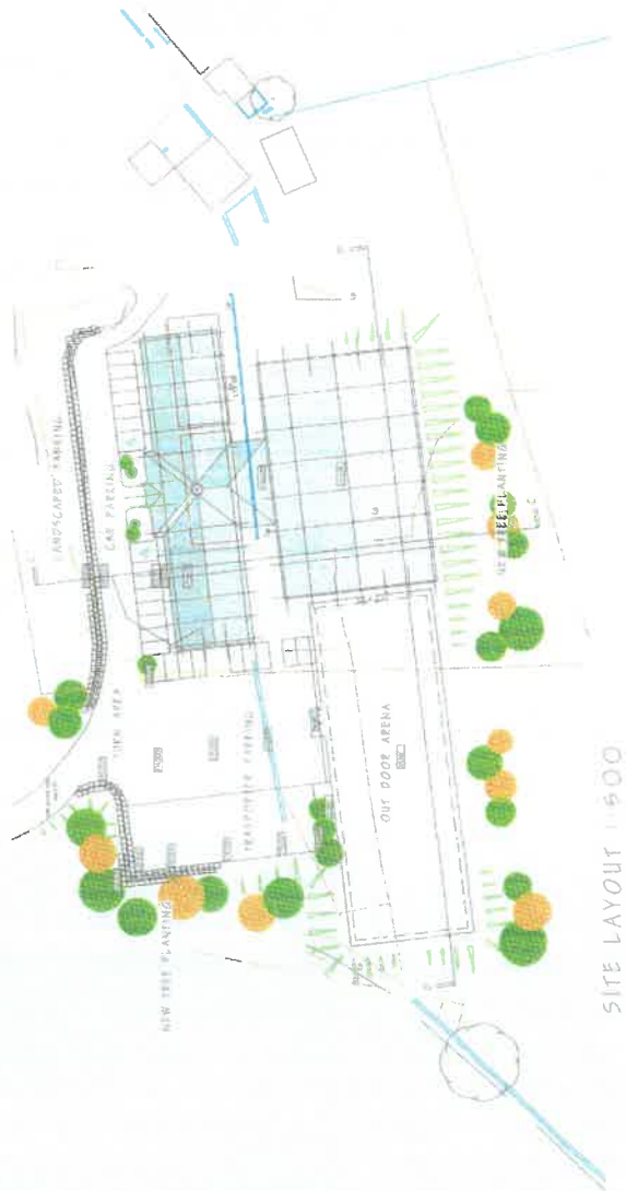
SITE LAYOUT 1:500