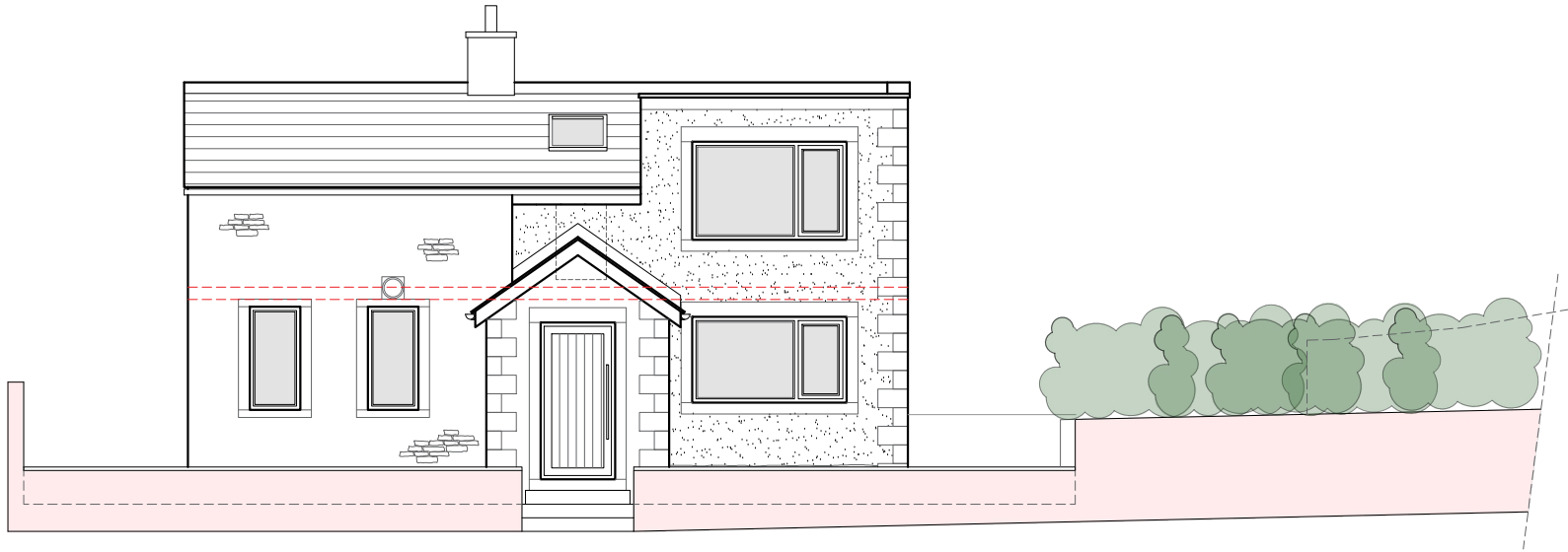
Proposed Street Scene (viewed from Pendleton Road) Scale 1:100

Note: All proposed external garden wall heights indicative only - all dimensions to be confirmed on site.