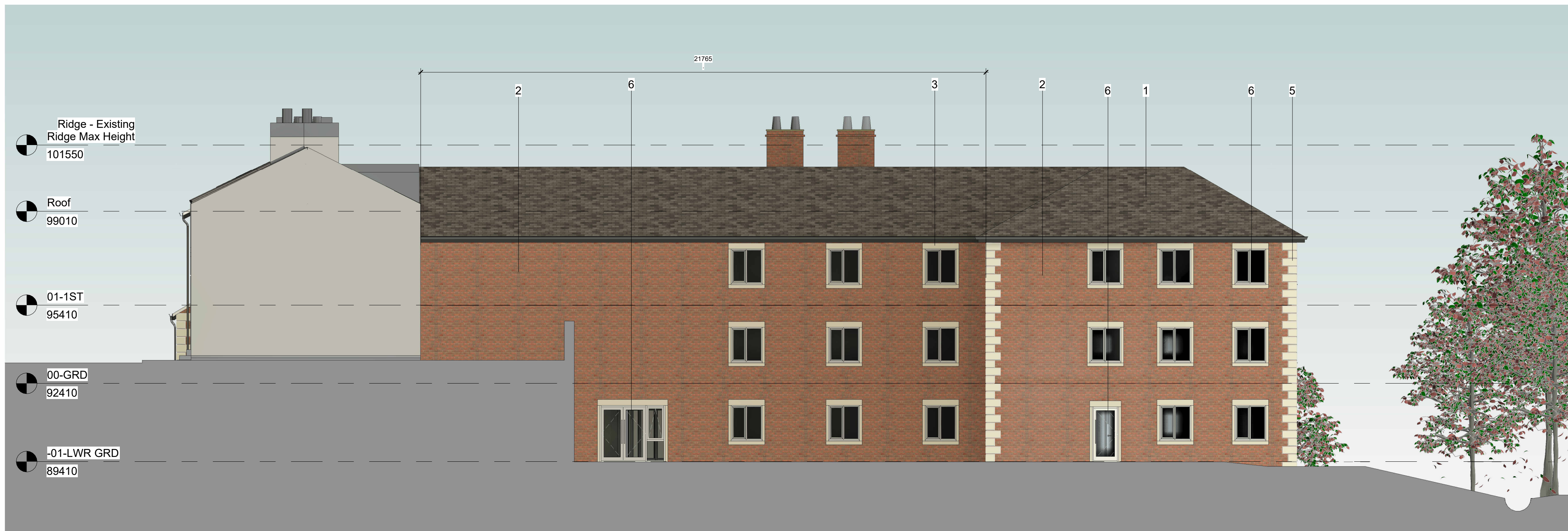
2 East Elevation 1 : 100