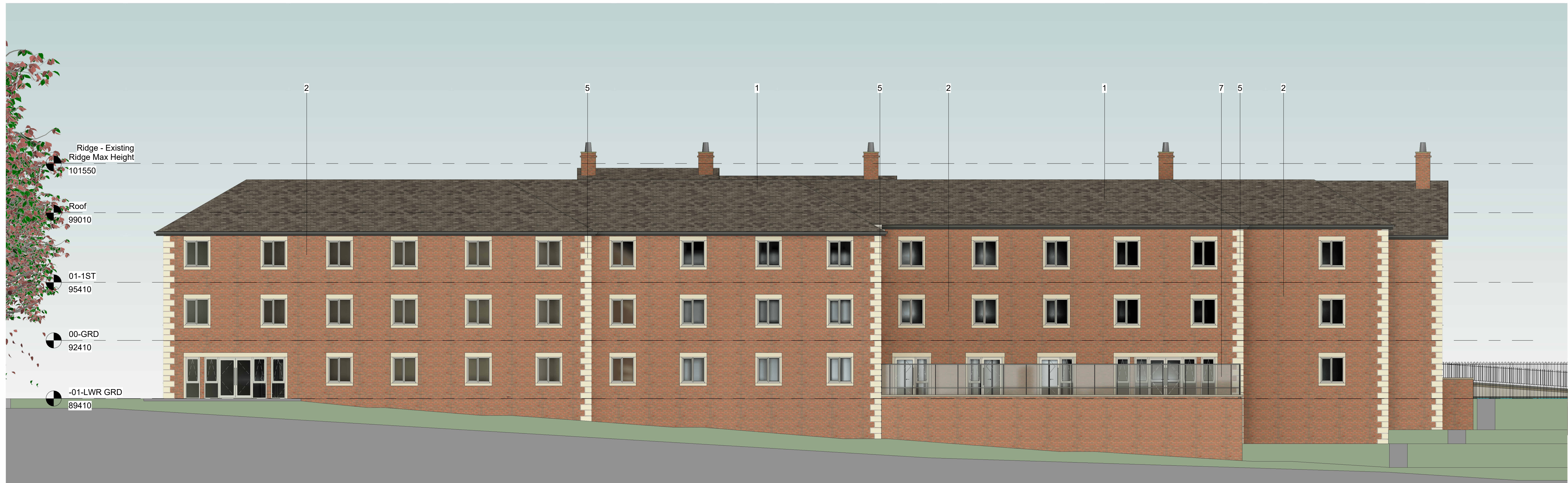
1 North Elevation 1 : 100