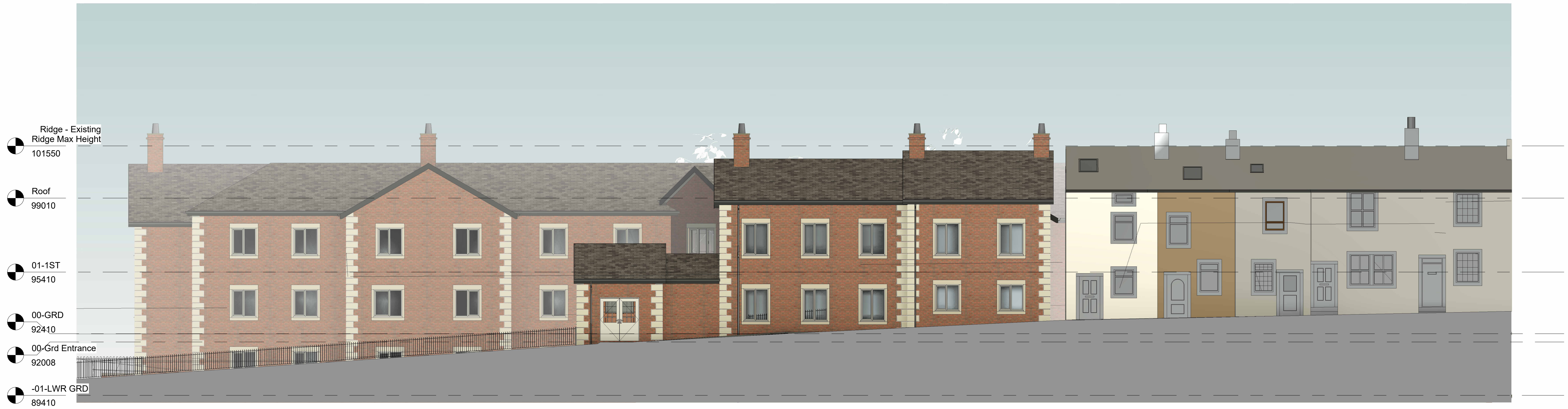
1 South Elevation 1 : 100