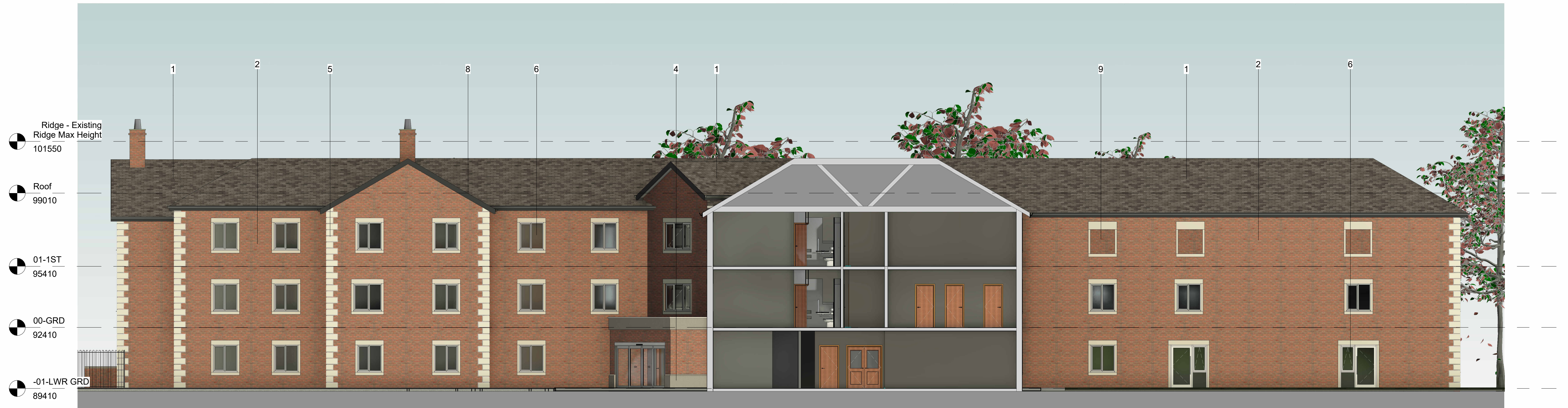
1 South Courtyard Elevation 1 : 100