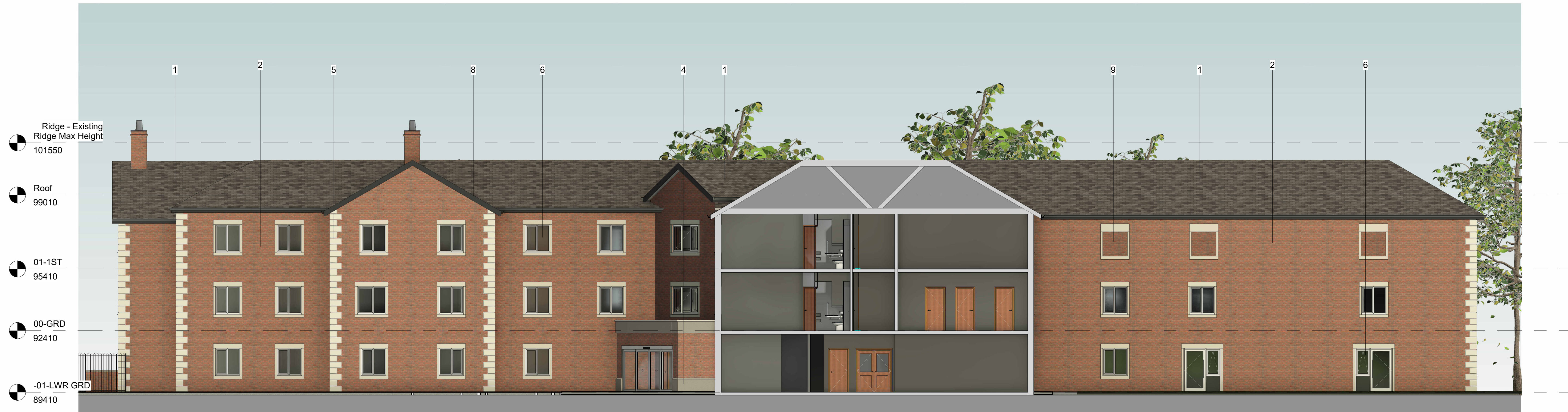
1 South Courtyard Elevation 1 : 100