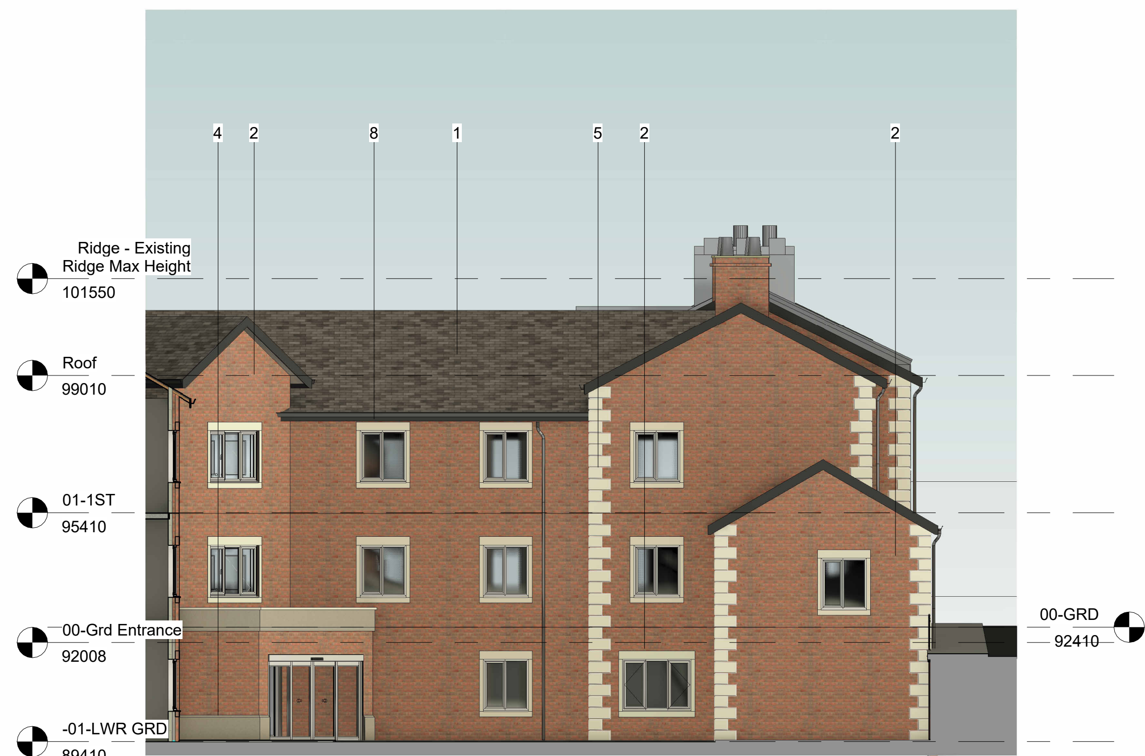
2 West Courtyard Elevation 1 : 100