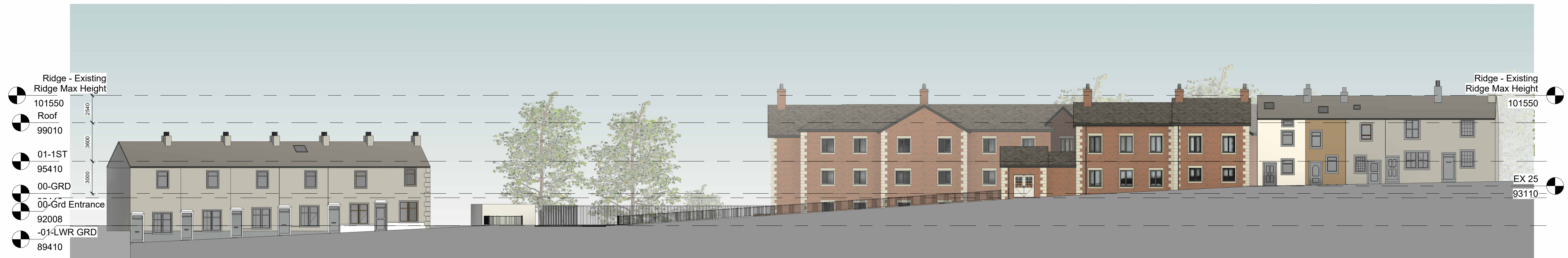
1 Proposed Street Scene 1 : 200