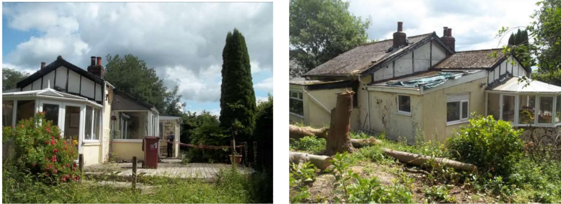
Front (south) and rear elevations

This is a redundant, detached dwelling in deteriorating condition: