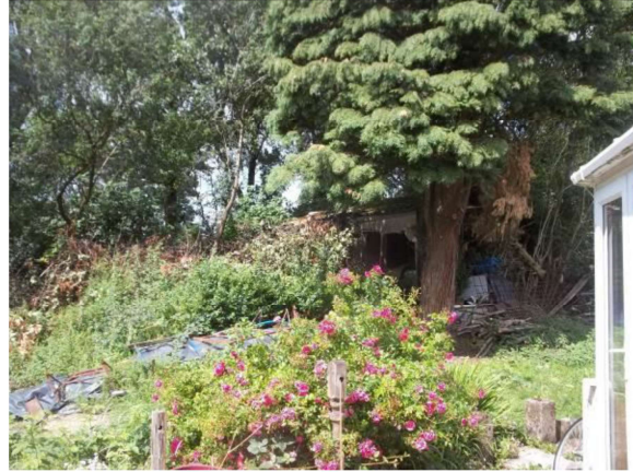
Garden with trees to west, mainly on neighbouring plot beyond

Vegetation, including shrubbery will inevitably be used by birds for nesting to some extent.