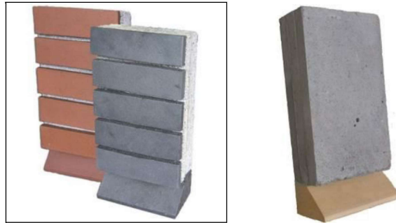
Example of Habitat boxes Can also be faced with stone.

“Designed to be built into an exterior wall and is available in a variety of faces to match the building. Standard facings of red or blue brick - ideal for new builds - are normally available from stock, or boxes can be made to your specific requirements with a face of brick, stone, timber, or plain (for rendering). Supplied un-pointed.”