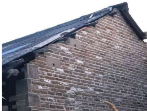
Example of Forticrete boxes in situ

A similar box is available from Habibat. See above listing.