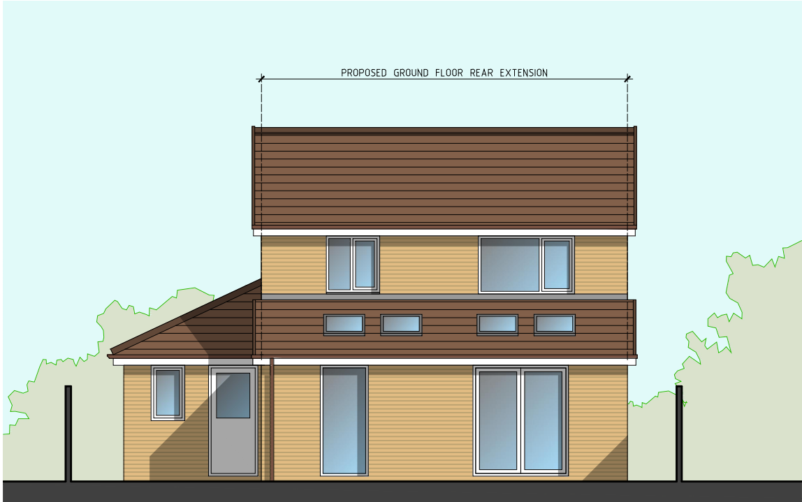
Rear (North) Elevation