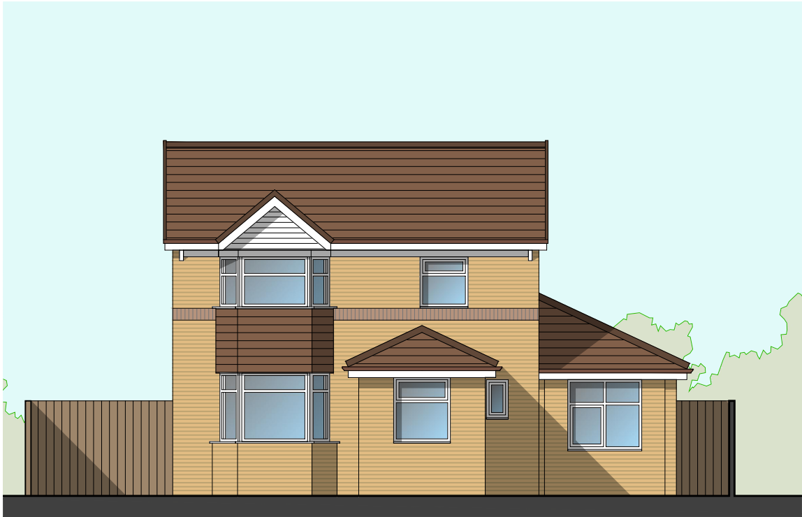
Front (South) Elevation