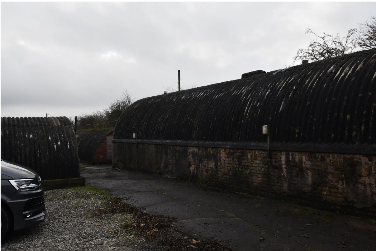
Image 2 Another view of smaller sheds