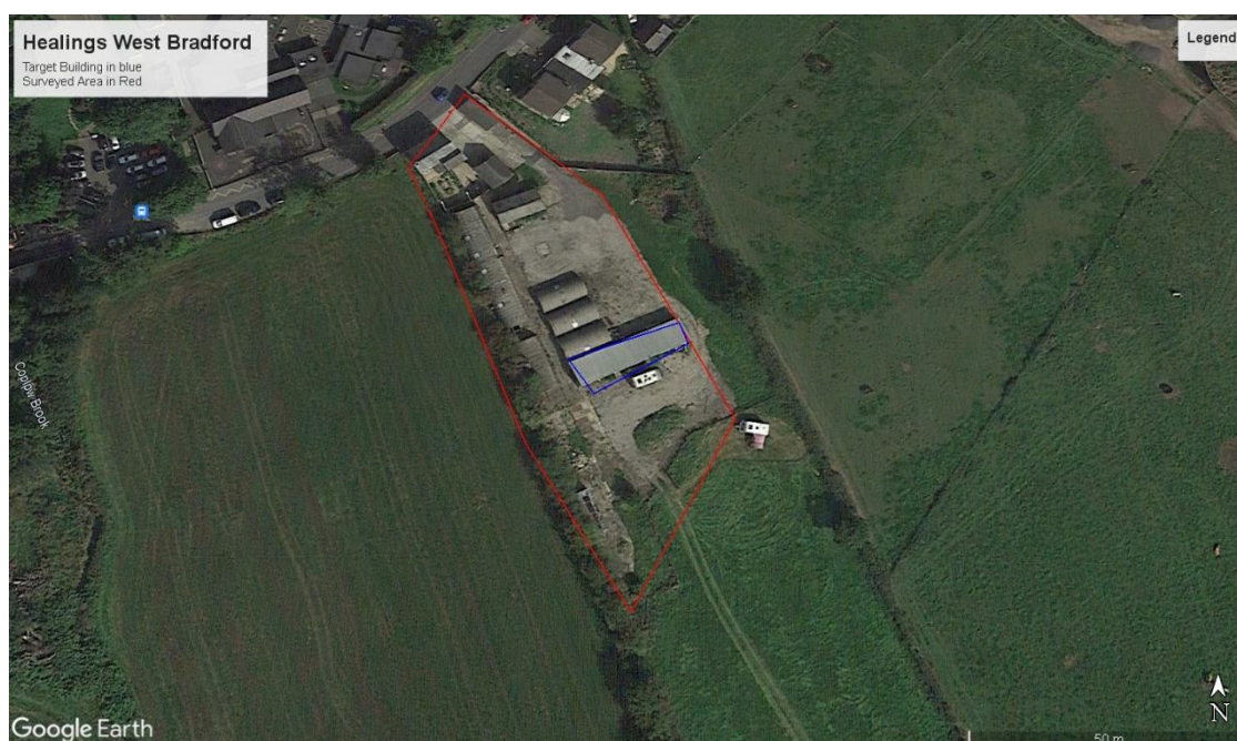
FIGURE 1. Surveyed area indicated by the red line above with target building in blue.