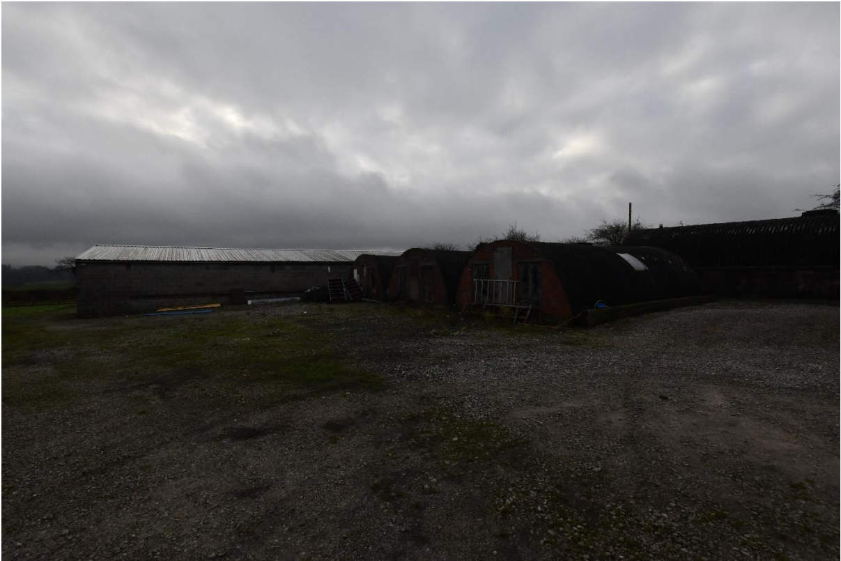
Image 1 South across site to large workshop (target building) and nissen type sheds