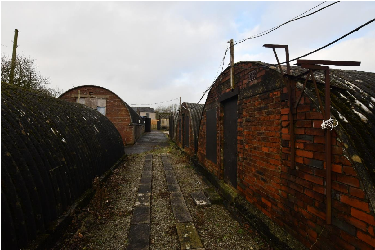
Image 5 Looking north through the various buildings