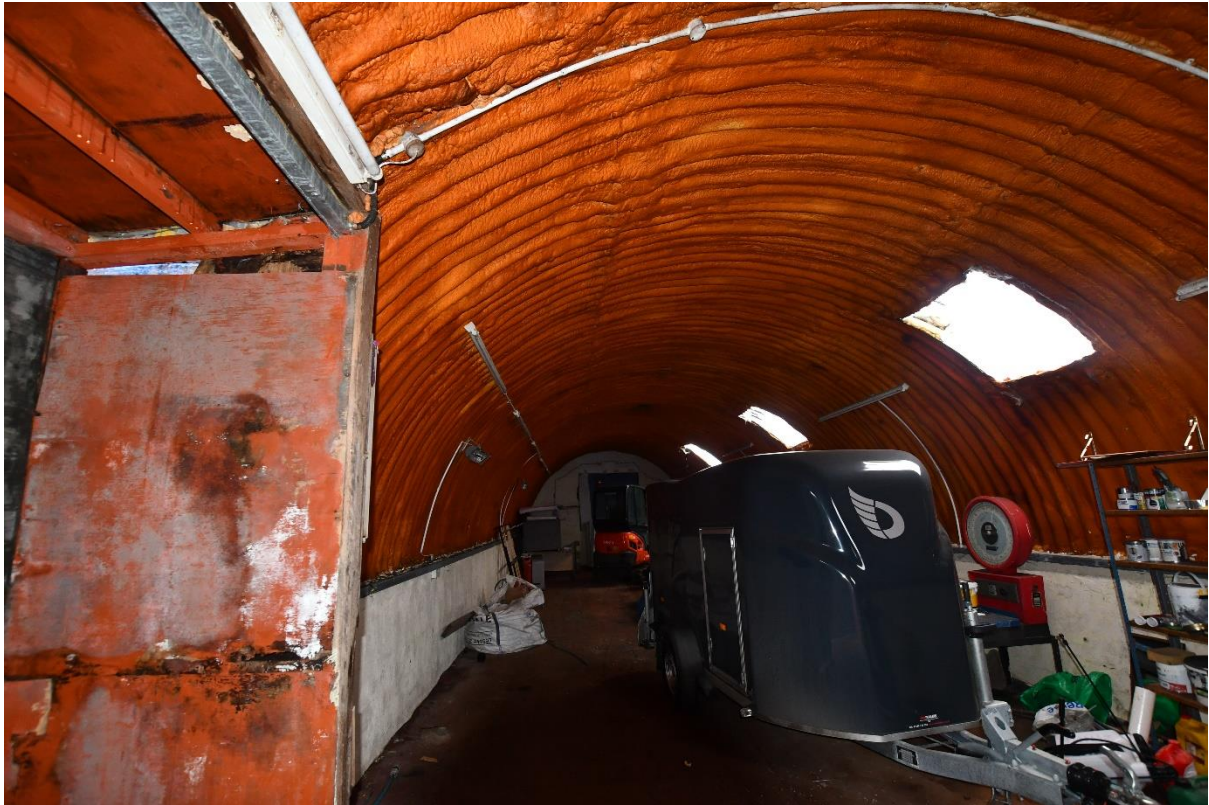
Image 3 Internal structure of Image 2 with ambient light from skylights