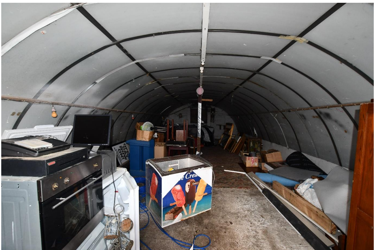
Image 4 Internal structure of large workshop target building