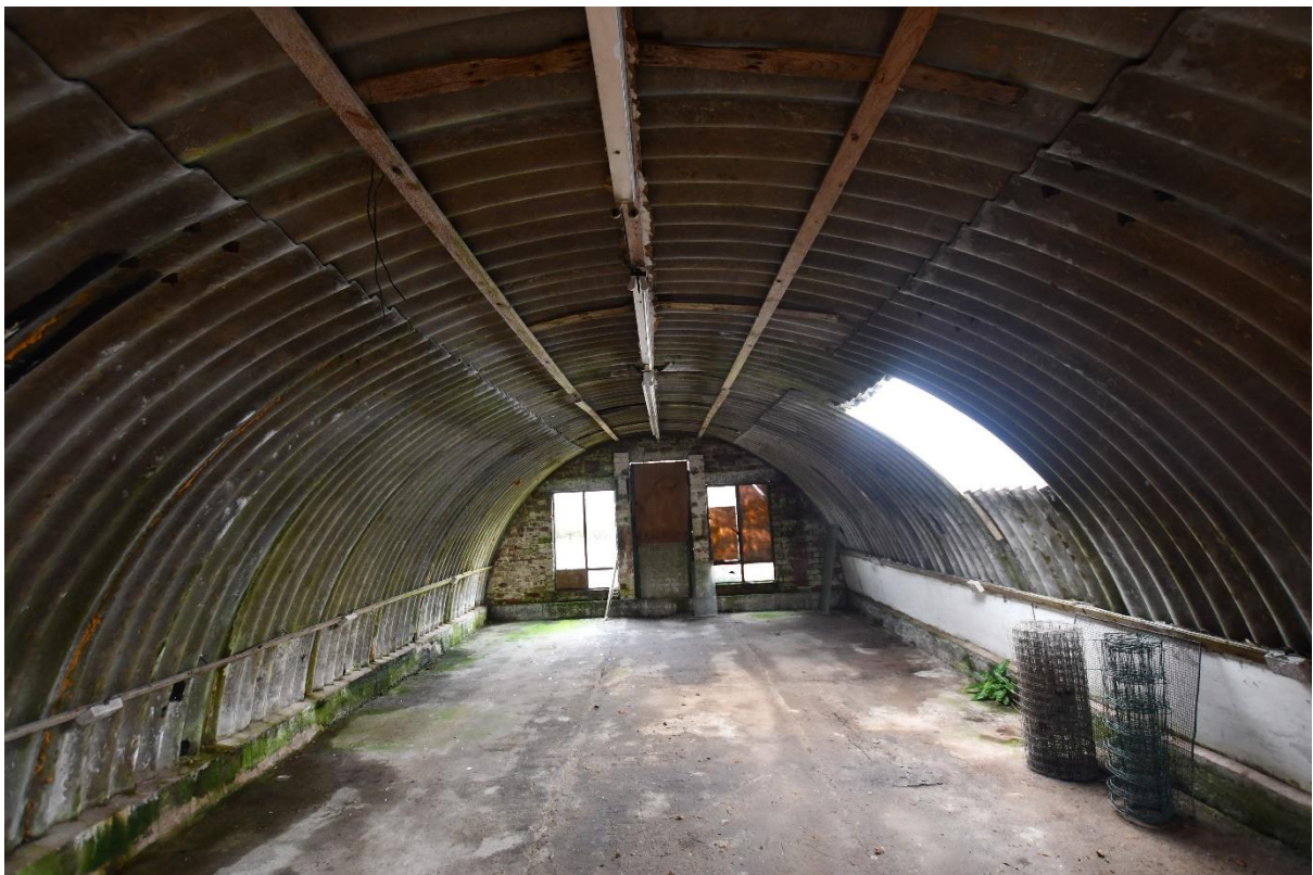
Image 6 Internal structure with ambient light