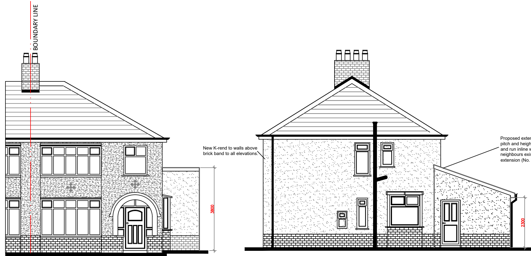
Proposed Front Elevation Scale: 1:100