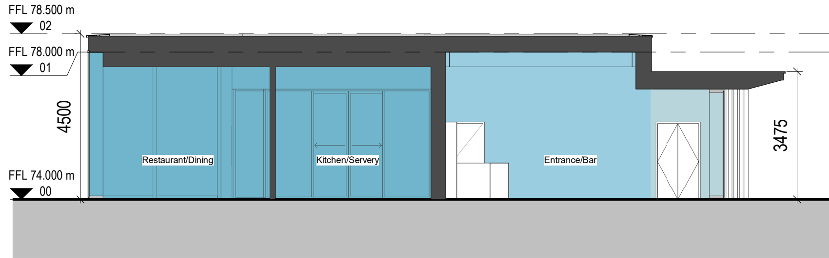
1 Section A-A 1 : 100