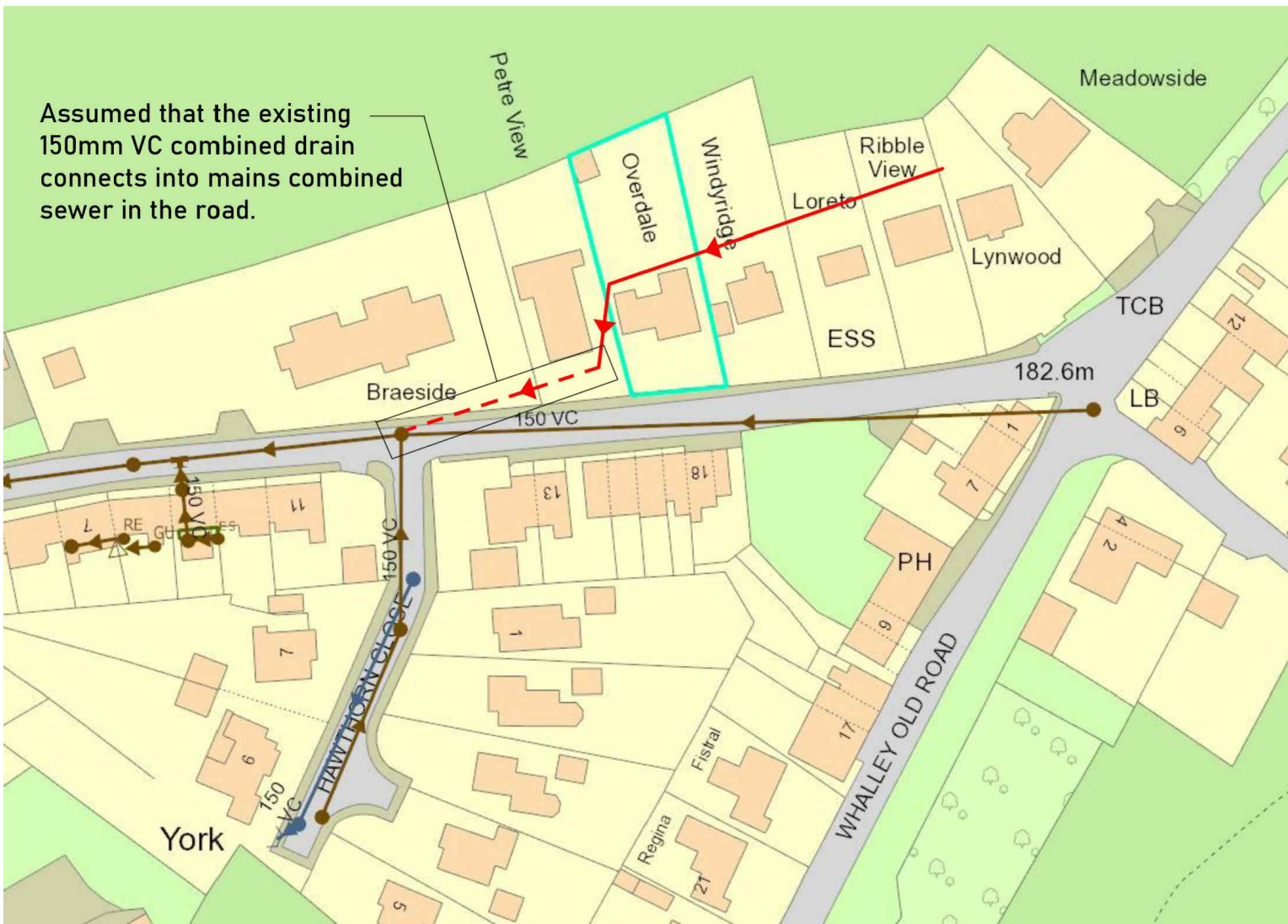
Extract of United Utilities' sewer record plan (NTS). Plan shows approximate position of existing combined drainage run through the site.

REVISIONS: Rev A - Position of soakaway amended. - 16.08.23 - NE Rev B - Garage omitted. - 18.08.23 - NE Rev C - Drainage strategy amended. - 13.09.23 - NE