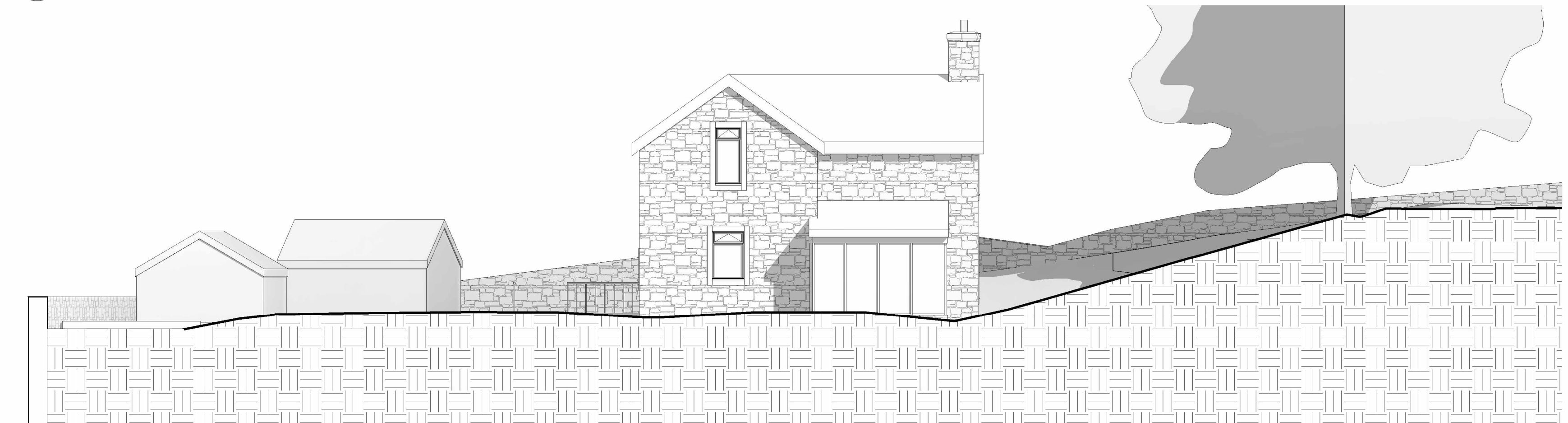
4 EXISTING SOUTH 1 : 100