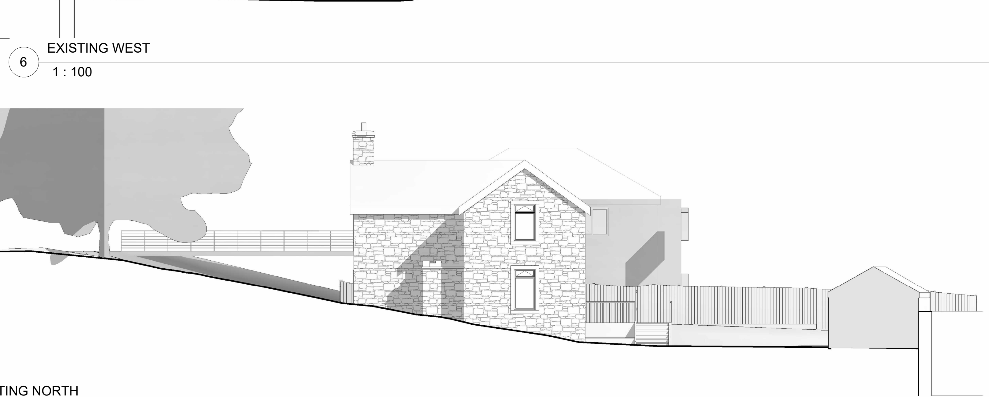
6 EXISTING WEST 1 : 100