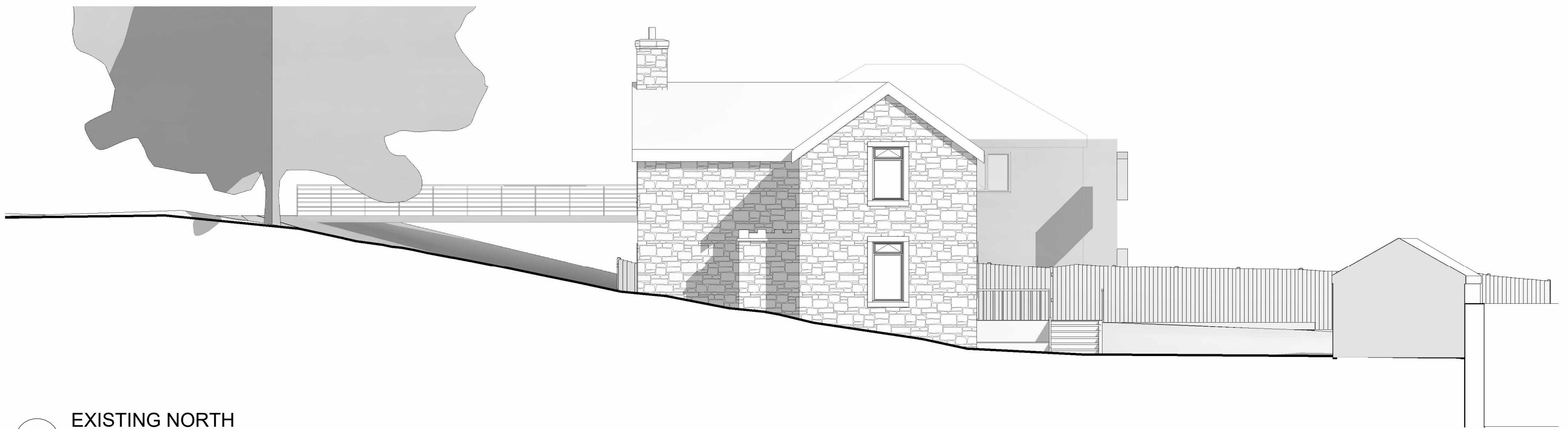
2 EXISTING NORTH 1 : 100